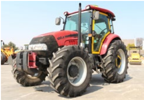
2014 Case Farmall 100JX Tractor