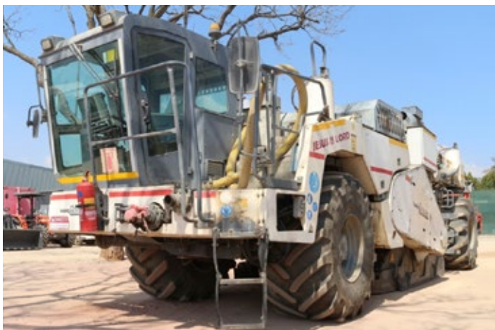
2008 Wirtgen WR2400 Recycler