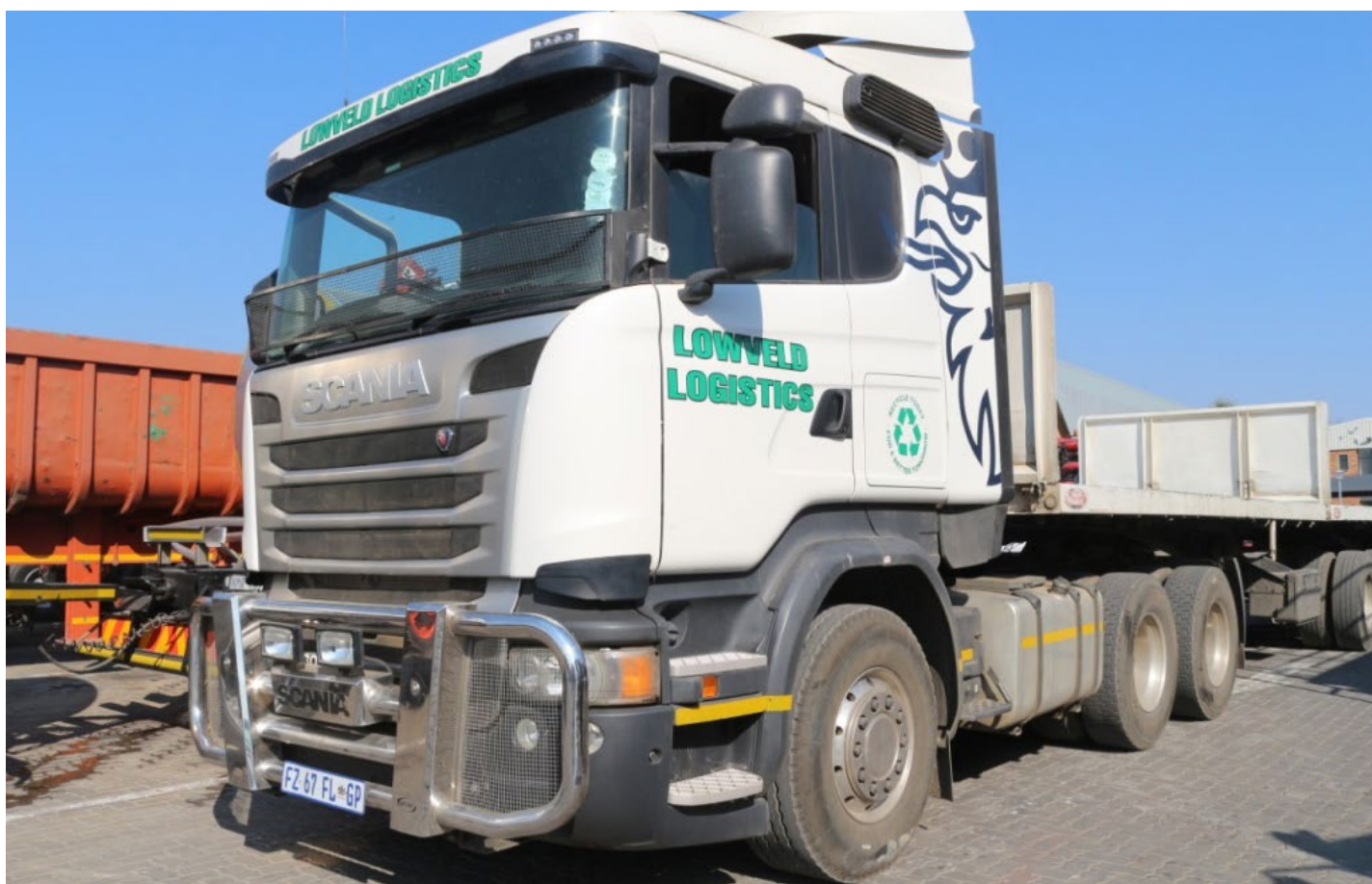
2015 Scania R460 6x4 Horse