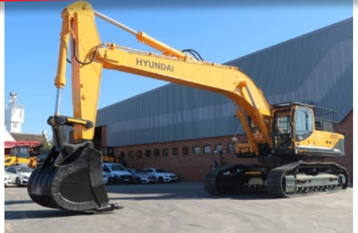
2012 Hyundai Robex R520LC-9S Excavator