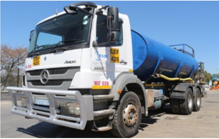
Mercedes Benz Axor 2628 14,000L Water Tankers (x4)