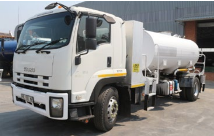
Isuzu FTR850 10,000L Water Tanker