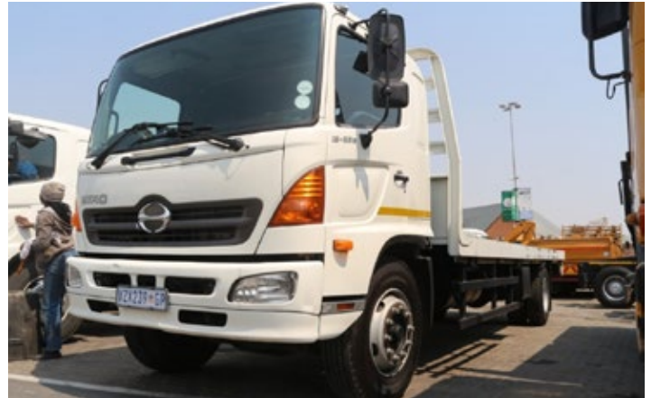
2007 Hino 15-258 Flat Deck