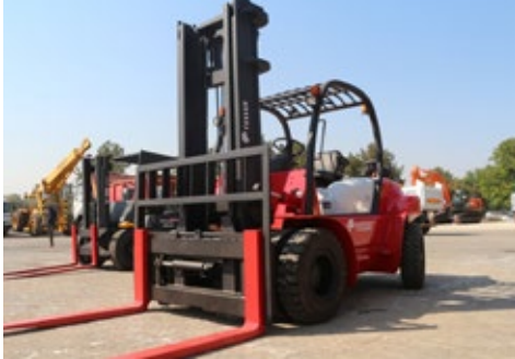
2014 Feeler FD50-TA 5Ton Forklift