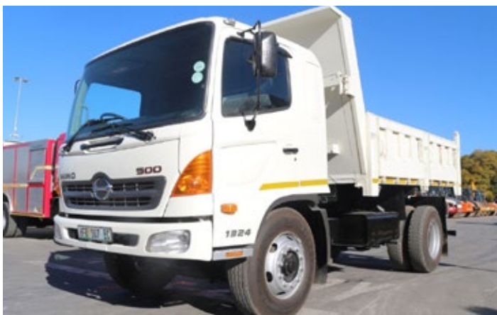
2014 Hino 500 1324 6m 3 Tipper Truck