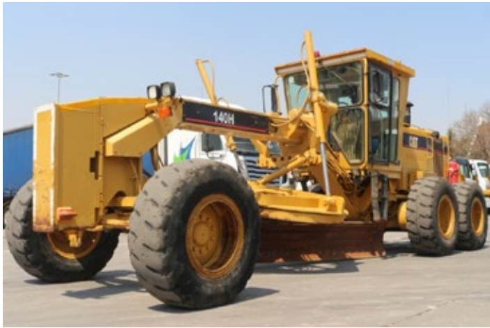
2007 Caterpillar 140H Grader