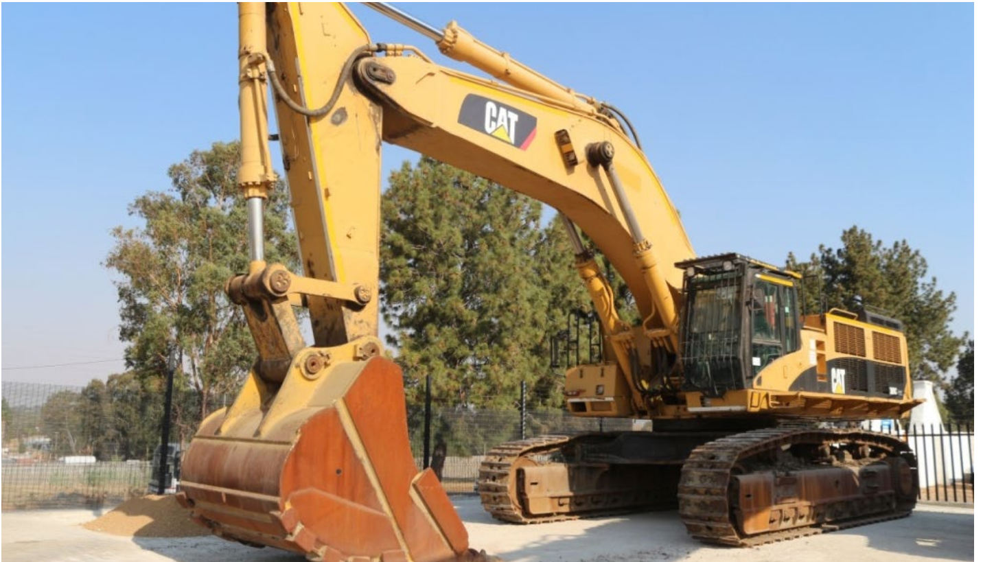
2008 Caterpillar 385C LME Excavator

12 EXCAVATORS AVAILABLE - SEE WEBSITE FOR FULL LIST & PHOTOS