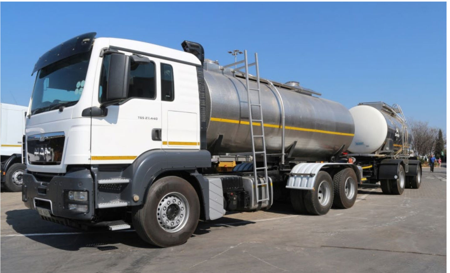
2014 MAN TGS 27-440 Milk Tanker