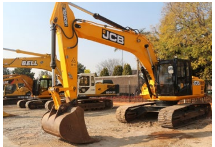
2015 JCB JS205LC Excavator