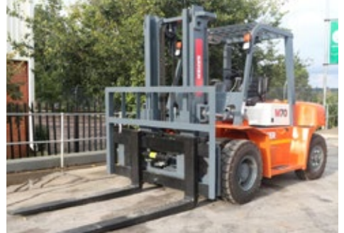
2018 Saker 7 & 3 Ton Diesel Forklifts