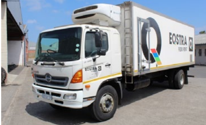
2004 Hino 15-258 Refrigerated Body (Choice of 2)