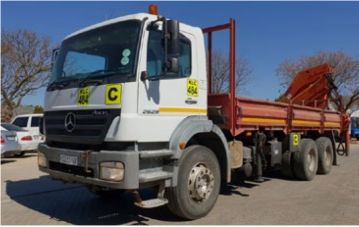
2009 Mercedes Benz Axor 2628 6x4 Crane Trailer