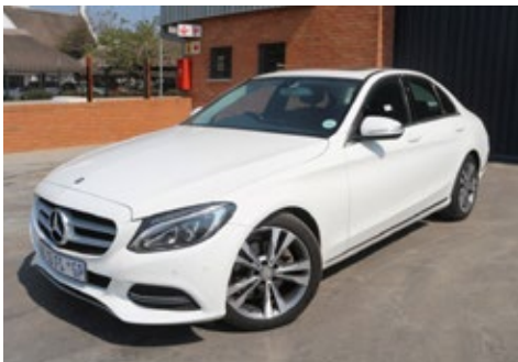
Mercedes-Benz Financial Services A, C, ML, GLA Class Vehicles