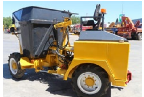
Concrete Site Dumper