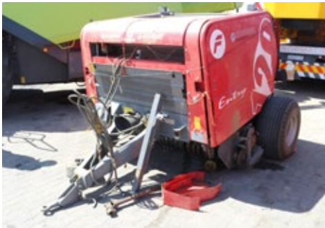
2013 Feraboli Entry 120 Round Baler