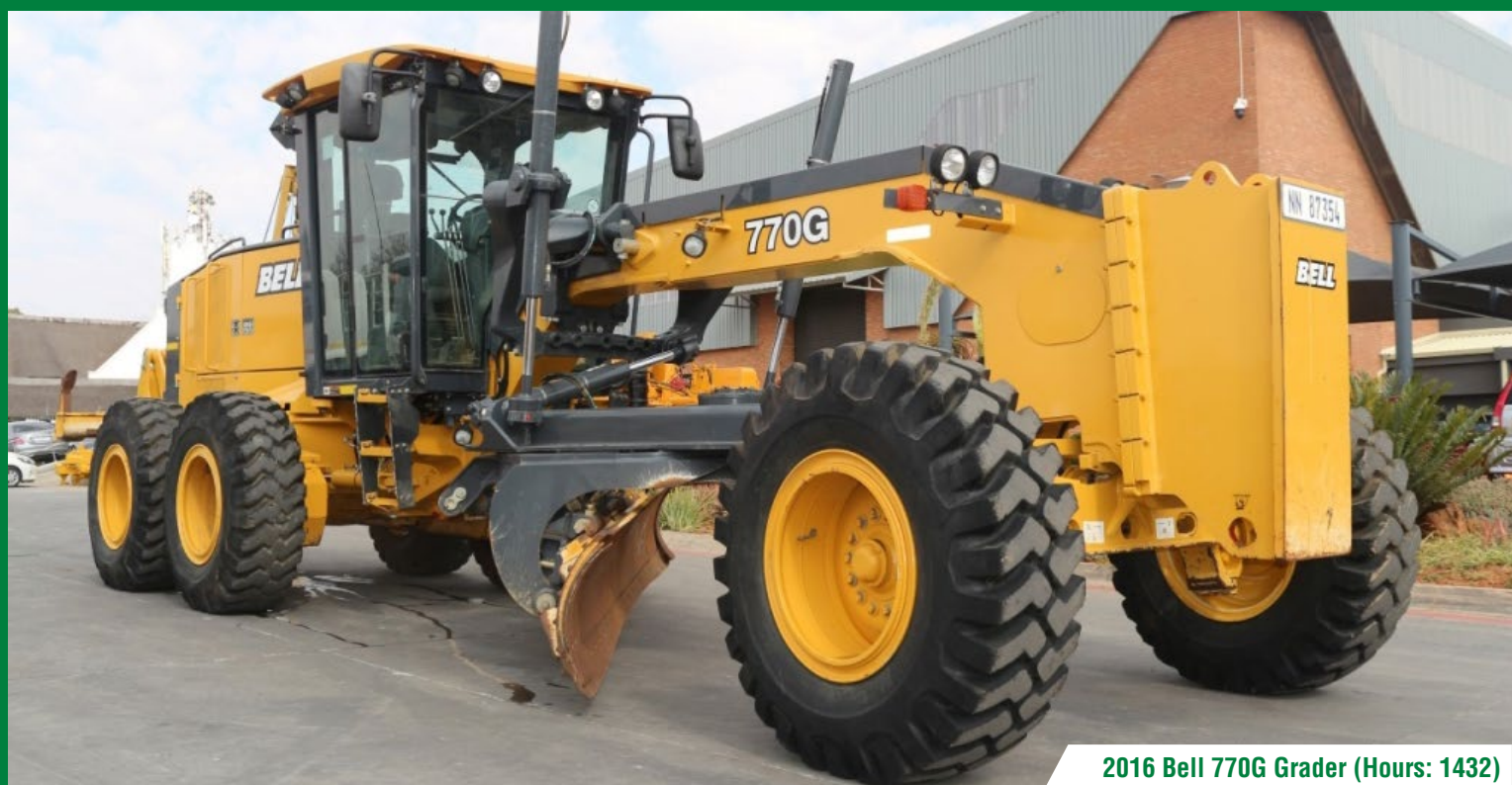
2016 Bell 770G Grader (Hours: 1432)

See full auction inventory online whauctions.com