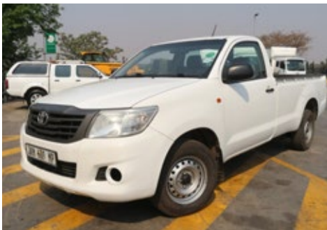
Toyota Hilux, Nissan Hardbody, Nissan NP200, GWM LDV's