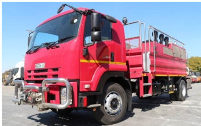
2011 Isuzu FTR850 Fire Tender Truck