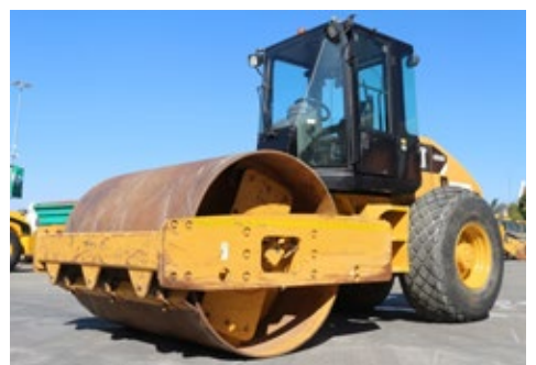
2013 Caterpillar CS533E Smooth Drum