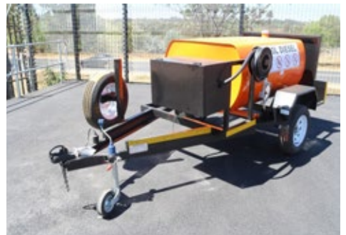
Various Small Plant including diesel bowsers, power tools, trailers, pumps, generators, compressors etc.