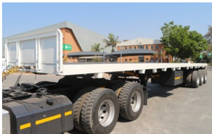
Flat Deck Trailers (3 available)