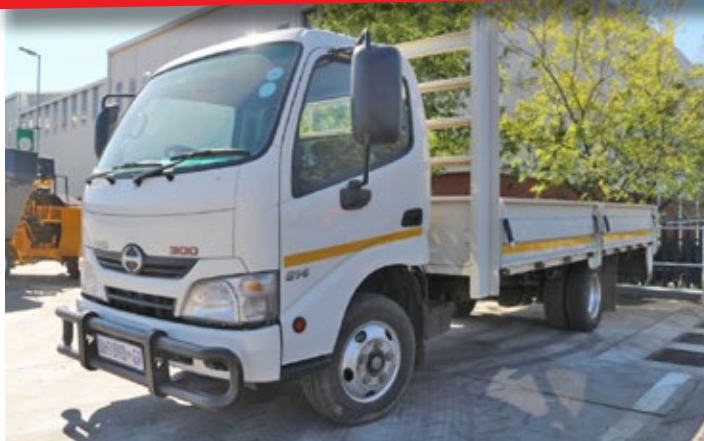
2014 Hino 300 614 Drop Side (Choice of 2)

9 DROPSIDE TRUCKS AVAILABLE - SEE WEBSITE FOR FULL LIST & PHOTOS