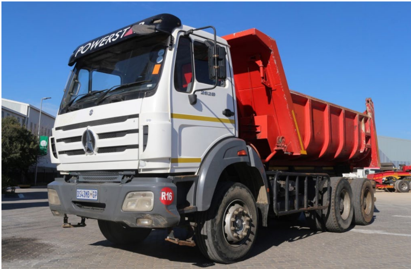
2015 / 2014 Powerstar 2628VX 10m 3 Tippers (Choice of 3)