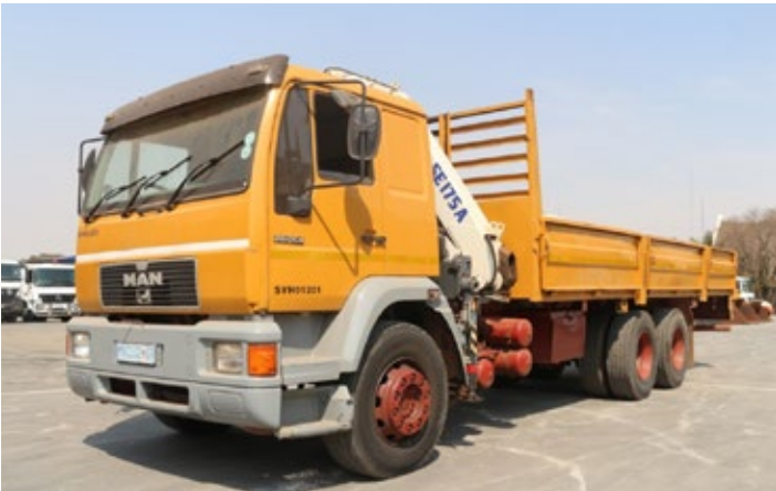
2001 MAN 26-264 6x4 Crane Truck