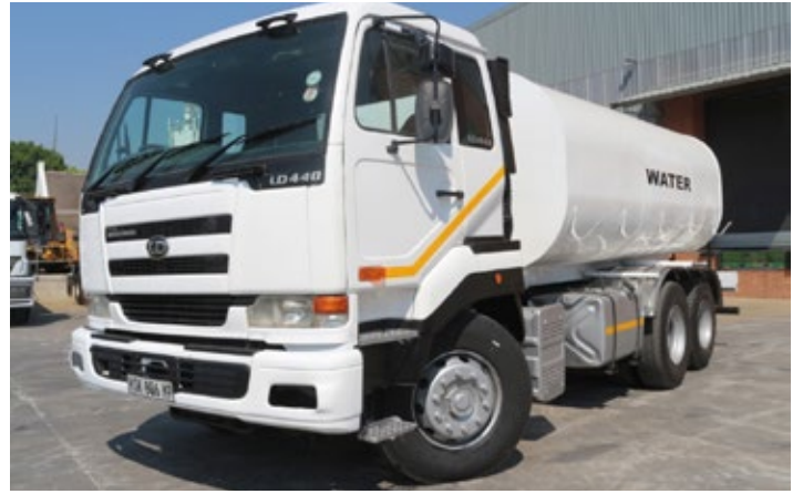
Nissan UD440 6x4 Water Tanker