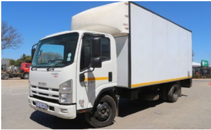
2017 Isuzu NQR500 AMT Closed Body