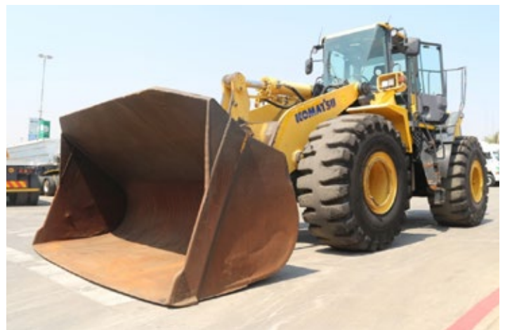
2015 Komatsu WA480-6 Wheel Loader