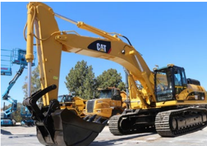
2012 Caterpillar 336D LME Excavator