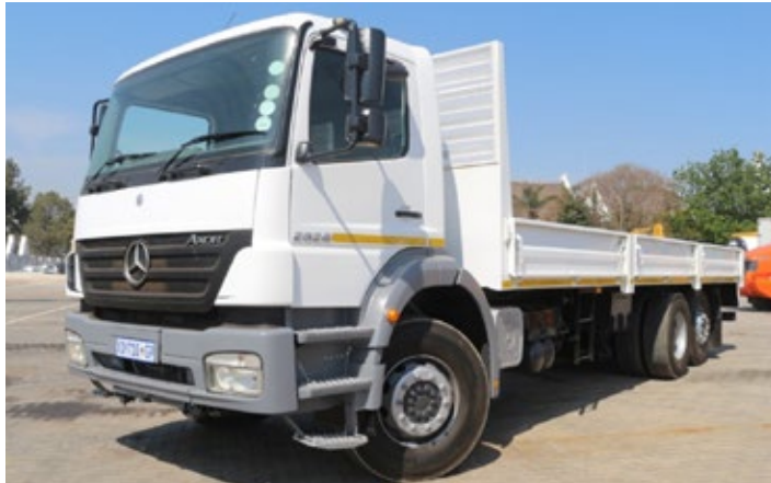
2008 Mercedes Benz 2528 6x2 Drop Side