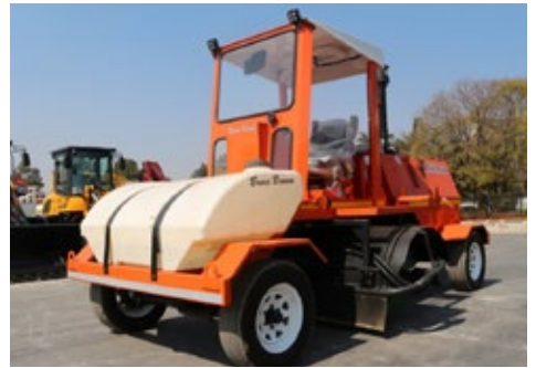
2010 Broce RCT350 Broom