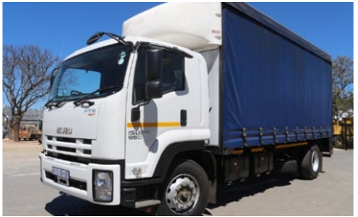
2017 Isuzu FTR850 AMT Tautliner