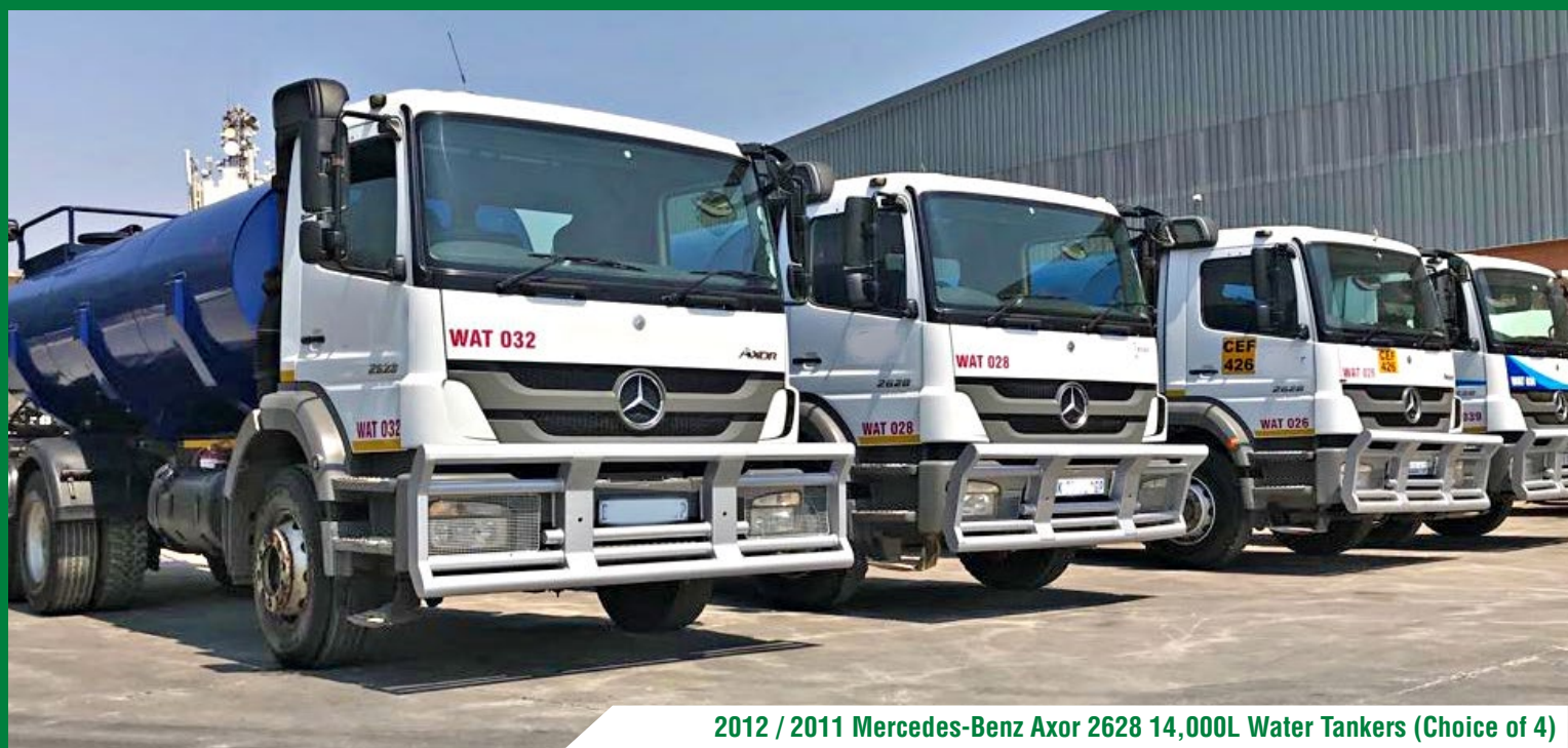
2012 / 2011 Mercedes-Benz Axor 2628 14,000L Water Tankers (Choice of 4)

Wed 26 September at 578 16th Rd, Midrand (Jhb)