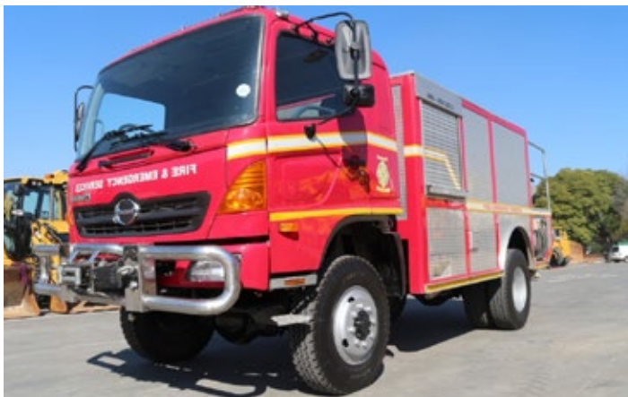
2010 Hino 4x4 Fire Truck * 2010 Nissan UD80 also available