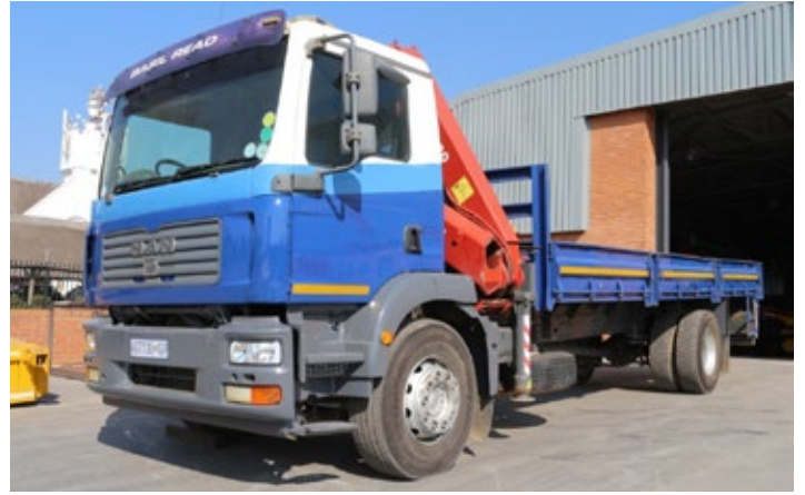
2006 MAN 18.240 Crane Truck