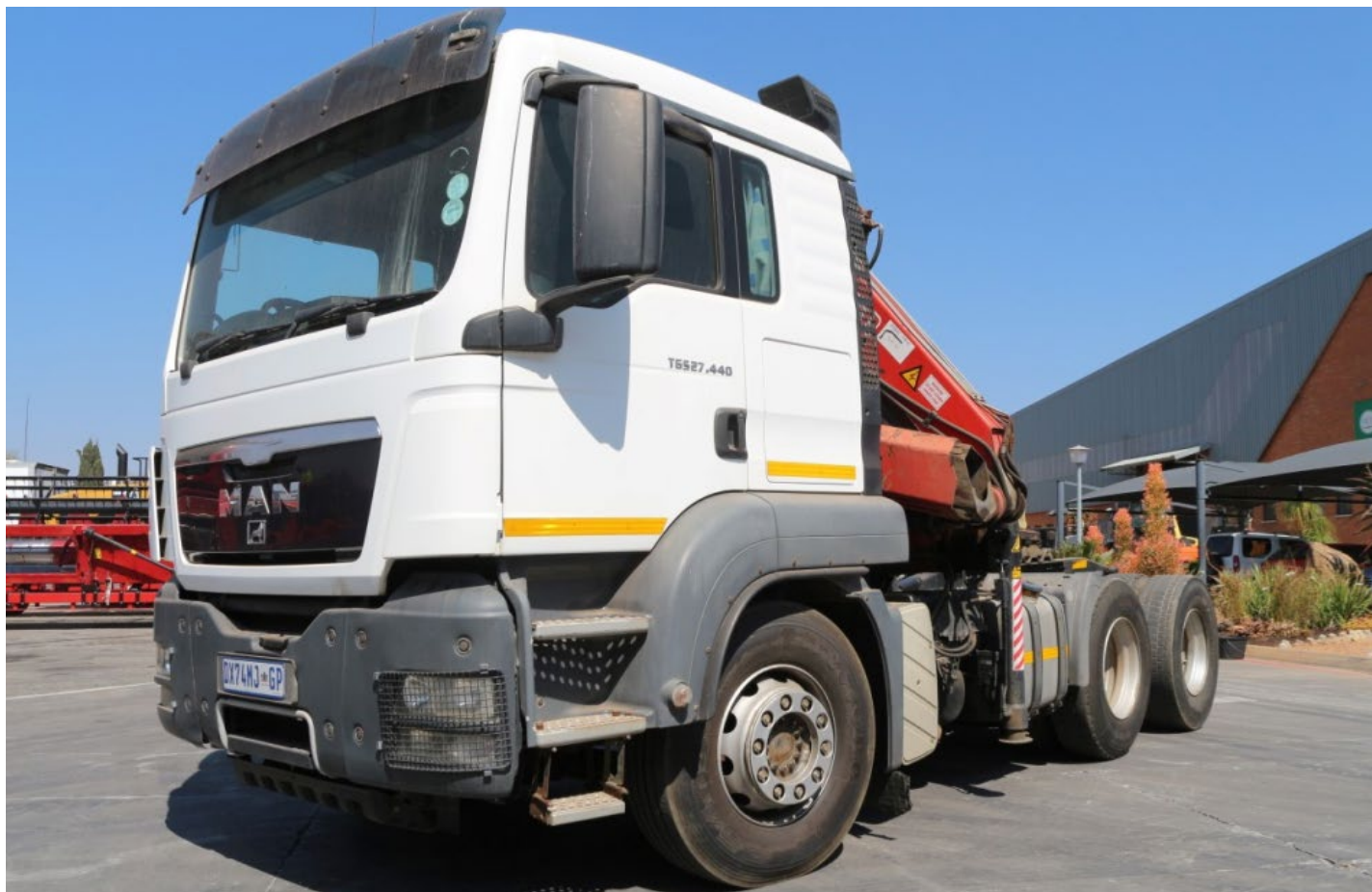
2012 MAN TGS27.440 6x4 Crane Horse