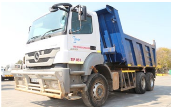
2011 / 2009 Mercedes Benz Axor 3335 12m 3 & 10m 3