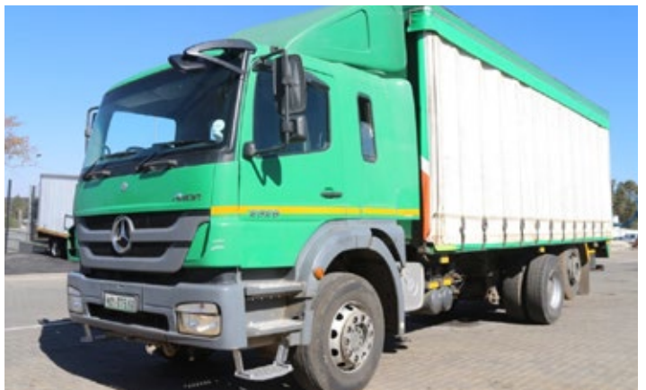
2010 Mercedes Benz Axor 2528 6x2 Tautliner