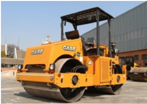
2018 Case 752 10Ton Tandem