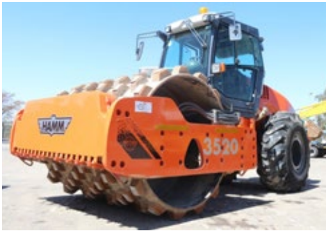
2010 Hamm 3520 Pad Foot