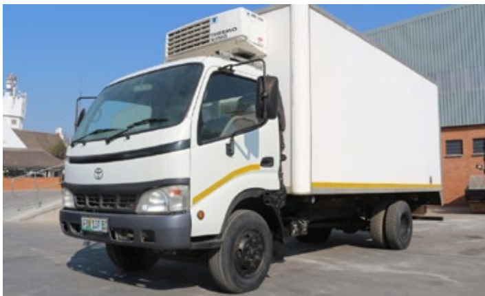
2008 Toyota Dyna 6-105 Refrigerated Body