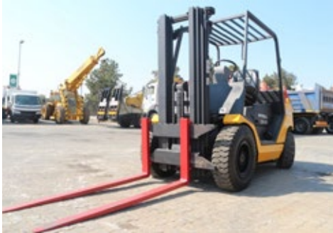
2001 Still R70-40 Forklift