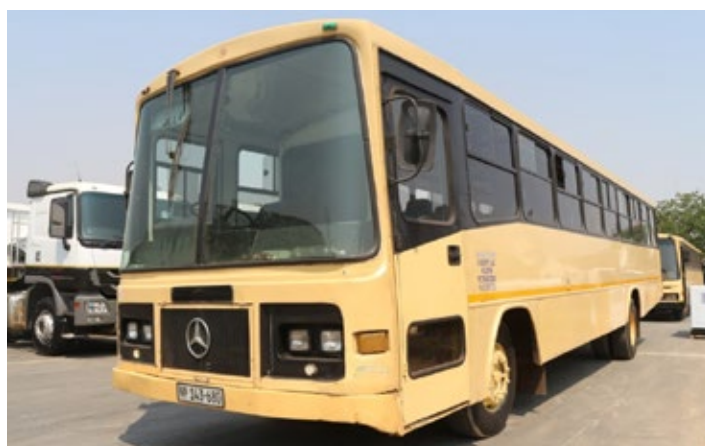
Mercedes Benz 1724 65 Seater Bus (Choice of 2)