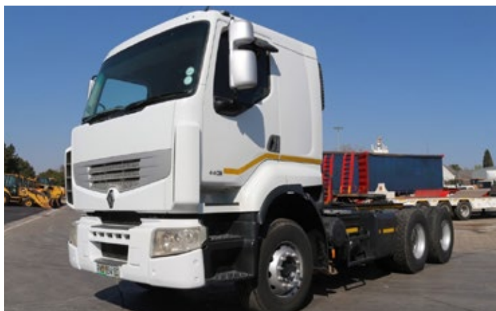
2011 Renault Premium Lander 440DXi Horse