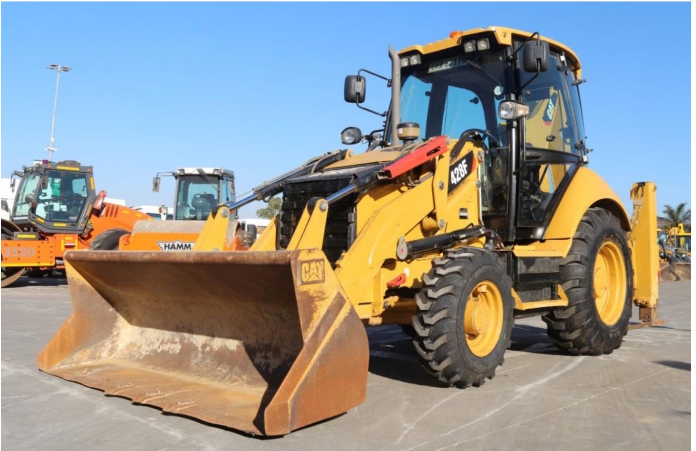
2014 / 2011 Caterpillar 428F 4x4 TLB's (Choice of 3)