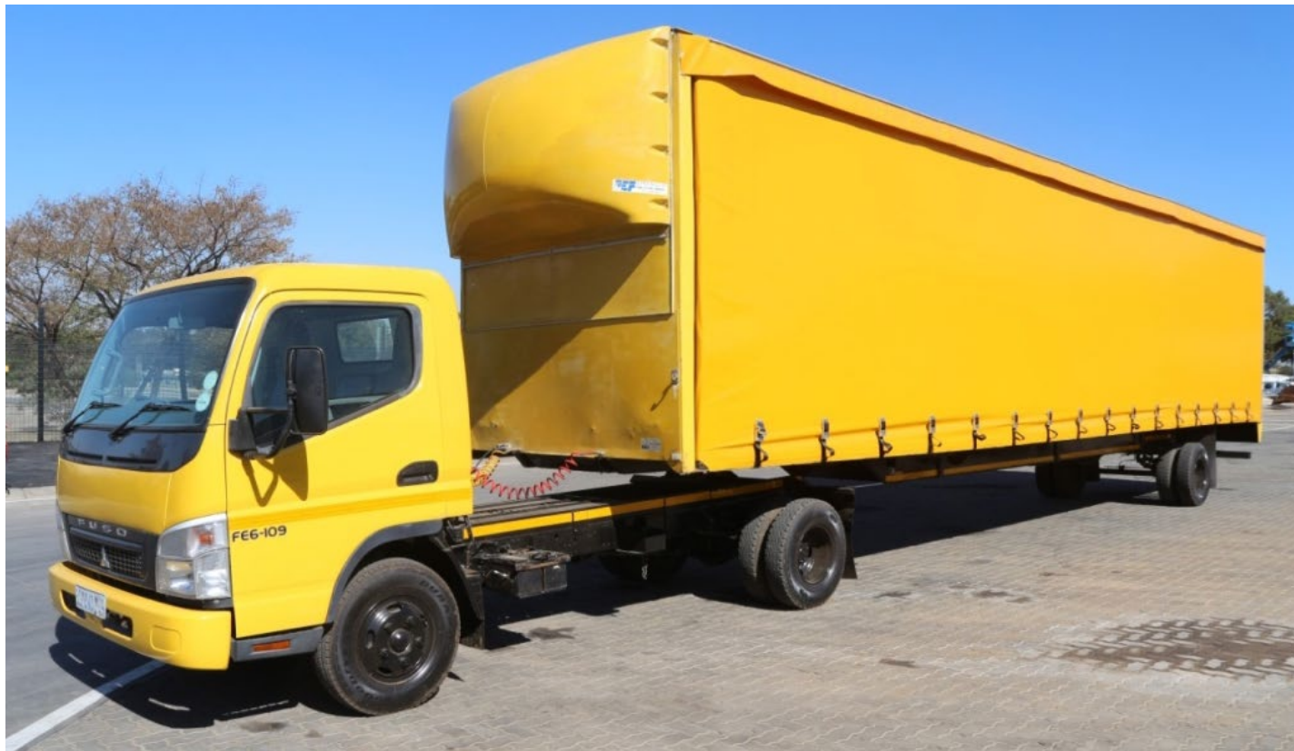
2010 Mitsubishi Fuso FE6-109 4x2 Horse and 2010 LCM Engineering Tautliner Trailer