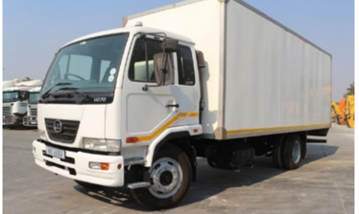
2013 Nissan UD70 Volume Van