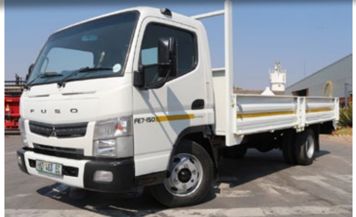
2015 Fuso Canter FE7-150 Drop Side AMT