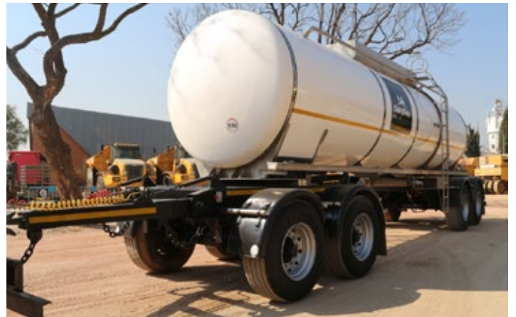
2015 CA Muller 23,000L Milk Tanker Draw Bar