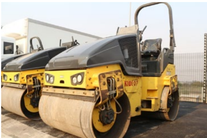
2013 Bomag BW120 AD-4 Rollers (Choice of 4)