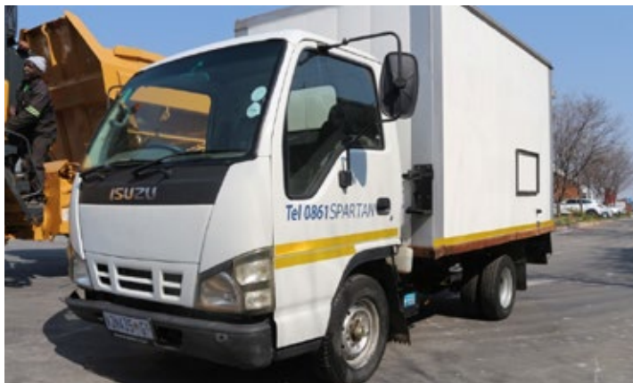
2007 Isuzu NHR150 Van Body