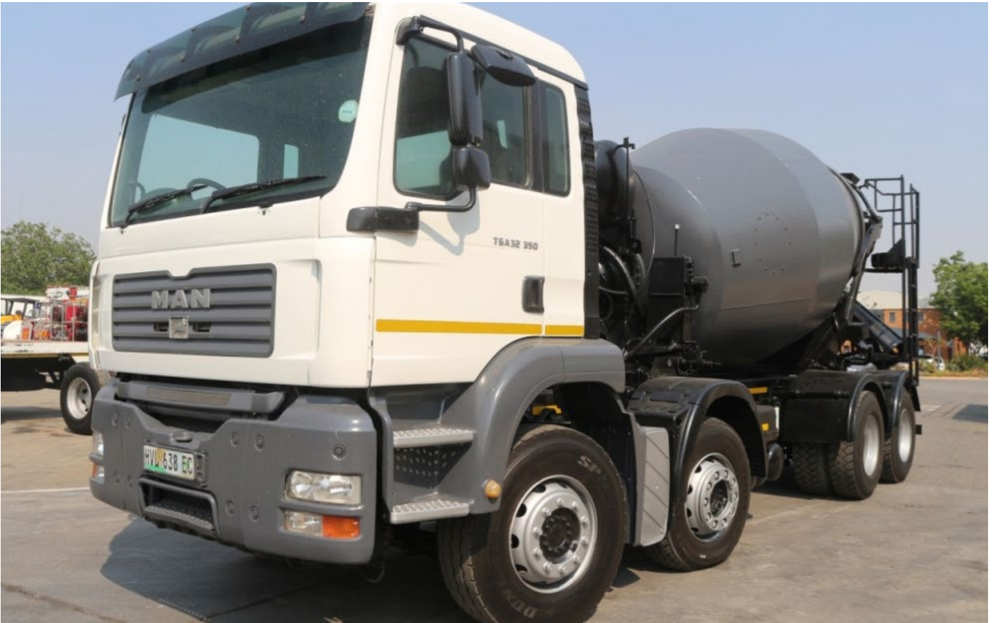
2007 MAN TGA 32-350 8x4 8m 3 and 2007 MAN CLA 26-280 6m 3 Cement Mixer Trucks