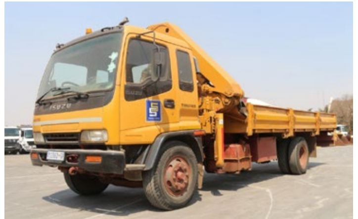
2004 Isuzu FTR Crane Truck