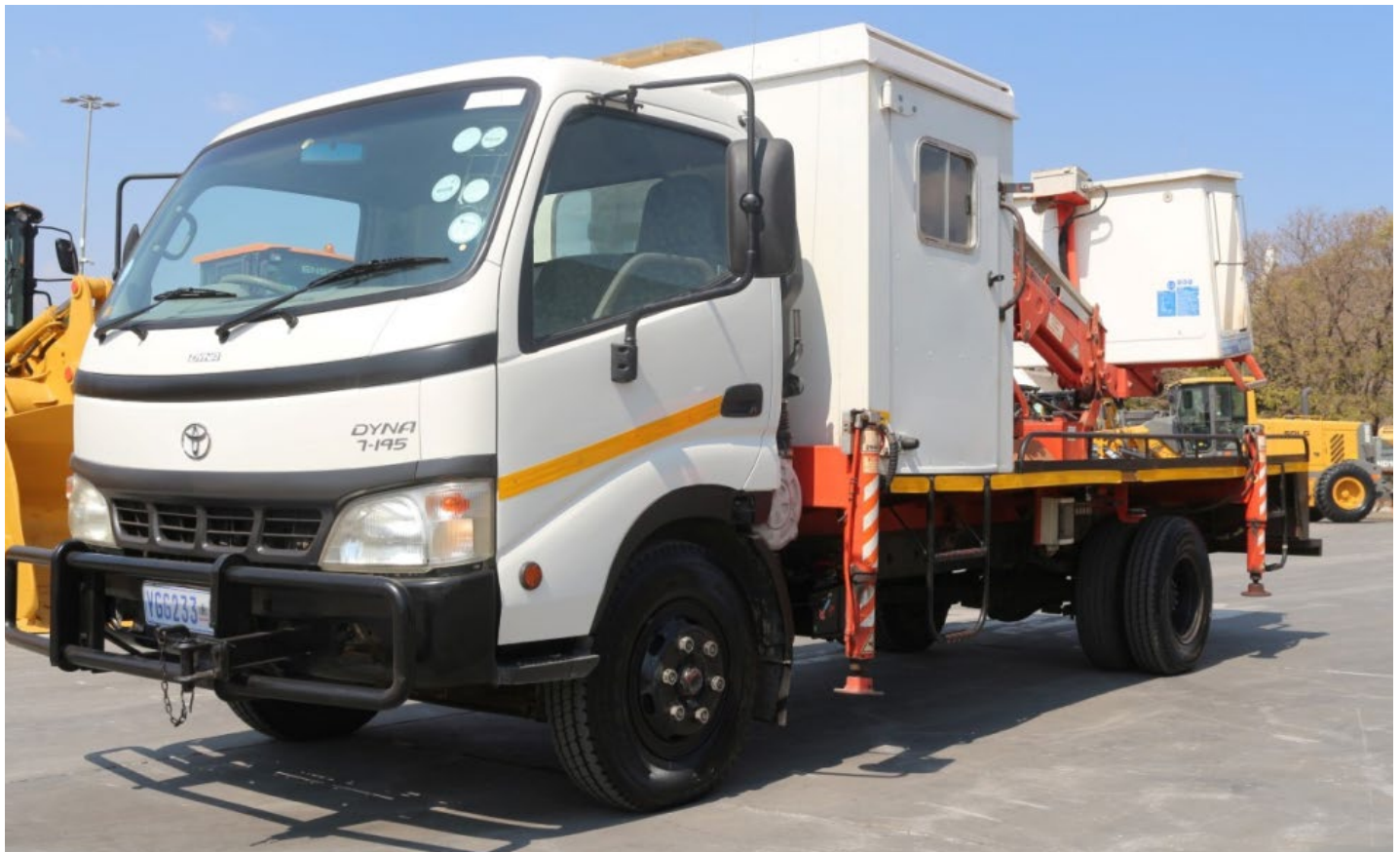
2009 Dyna 7-195 Cherry Picker Trucks (Choice of 2)