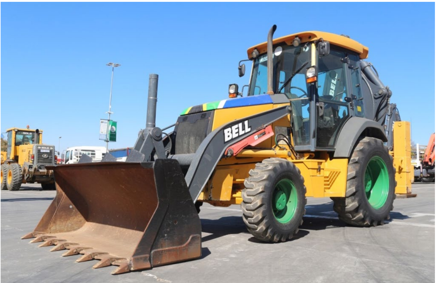
2015 / 2013 Bell 315SK 4x4 TLB's (Choice of 3)