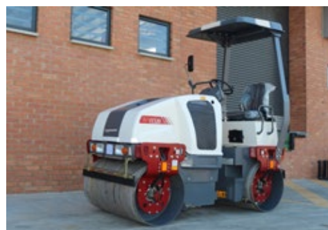
2018 Dynapac CC125 Tandem Roller