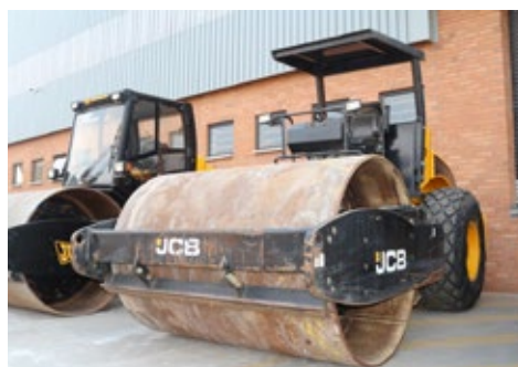
2015 JCB VM115 Vibromax Smooth Drum