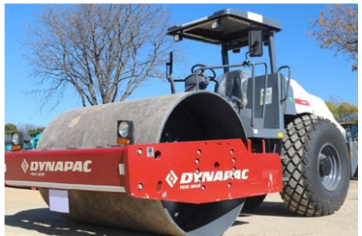
2018 Dynapac CA255 Smooth Drum (2)