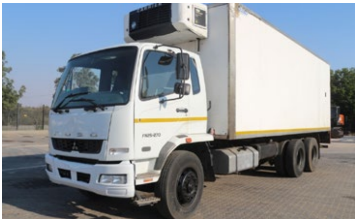
2013 Mitsubishi Fuso FN25-270 Refrigerated Body