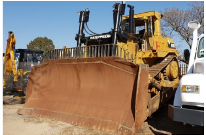
2003 Caterpillar D10R Dozer