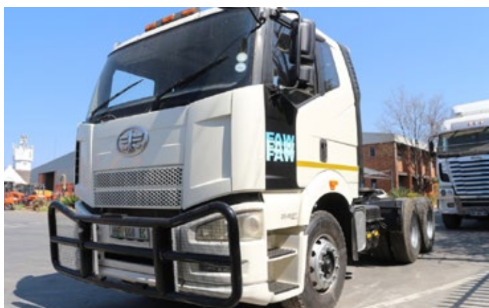
2014 FAW J6 28-460FT 6x4 Horse