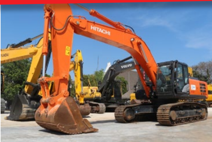
Hitachi Zaxis Z330LC-5G Excavator

12 EXCAVATORS AVAILABLE - SEE WEBSITE FOR FULL LIST & PHOTOS