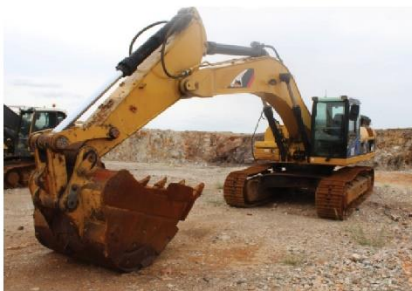
2010 Caterpillar 336D Excavator