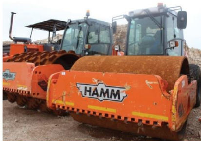
4 x 2013 Hamm 3520 Smooth & Padfoot Rollers

BID LIVE OR ON WEBCAST View: Mon 8 April or by appointment Deposit: R50,000 (EFT only) & FICA