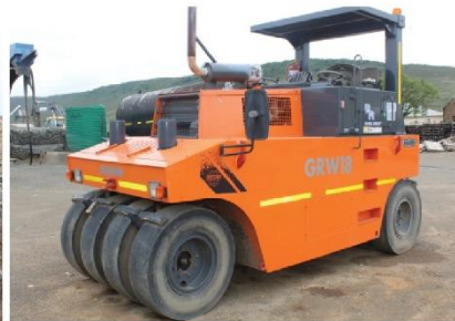
2010 Hamm GRW 18 Rubber Wheel Roller