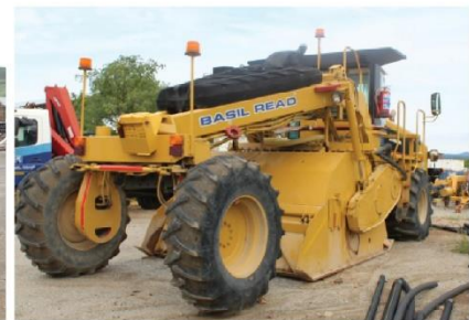
2010 Caterpillar RM300 Road Recycler