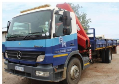
2011 Mercedes Benz Atego Downslope Crane Truck