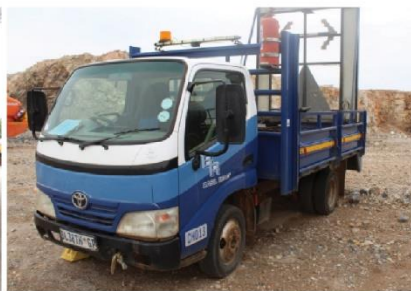
Toyota Dyna 150D Downslope Truck