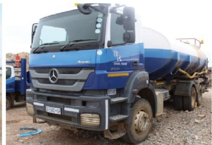
2010 Mercedes Benz Axor 3335 Water Tanker