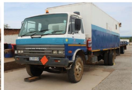
Nissan 536 CM14N Service Truck

OTHER: Quantity of Steel Containers, Site Offices & Ablutions ALL GOODS NEED TO BE REMOVED BY 12 APRIL 16H00. NO EXCEPTIONS