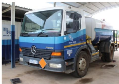
2010 Mercedes Benz Atego 1317 Diesel Bowser