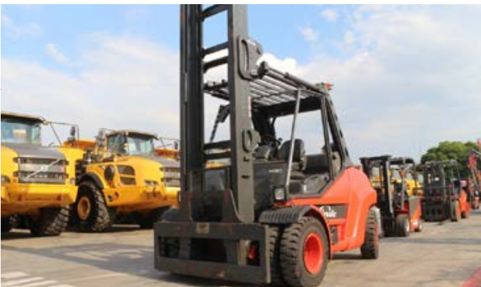
2013 Linde H80D 8 Ton Diesel