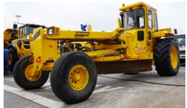
2017 Dezzi MG80T