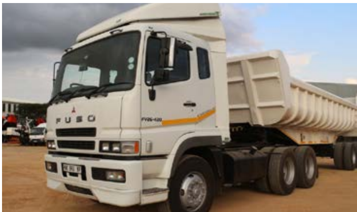
2015 Fuso FV26-240 6x4 (79123km)