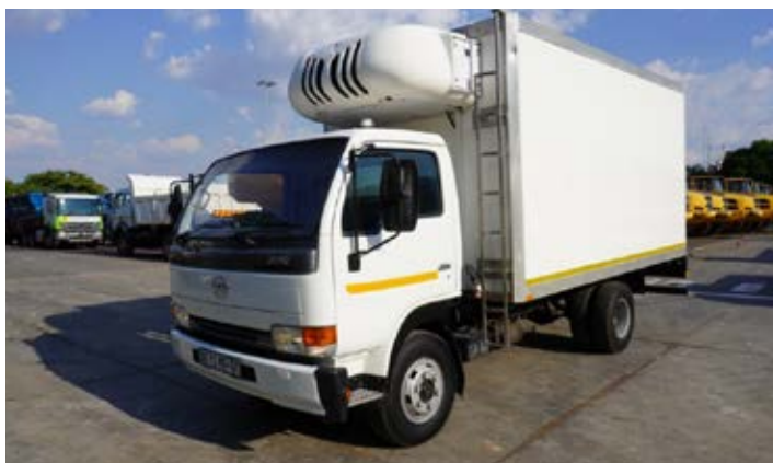
2014 Nissan UD40 Refrigerated