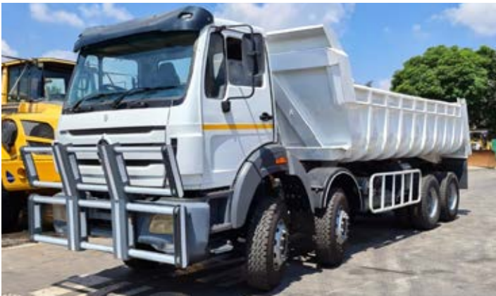
2x 2014 Powerstar 4035VX 8x4 16m 3 Tipper