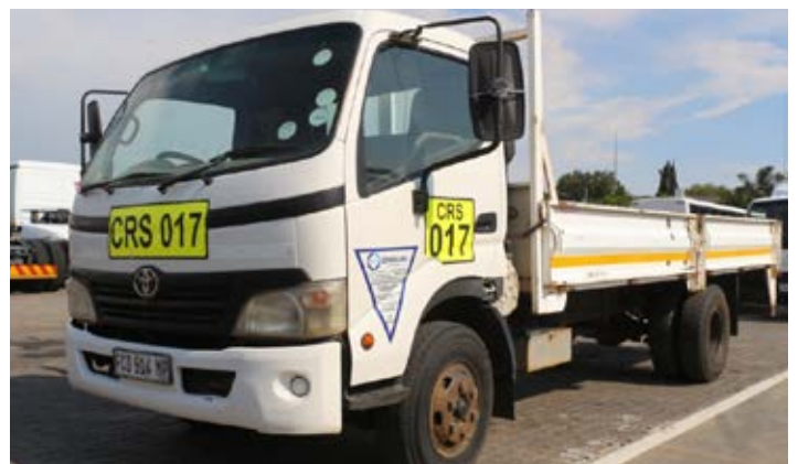
2009 Hino 300 4x2 Dropside