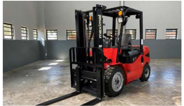
(Unused) Maximal 3 Ton Diesel