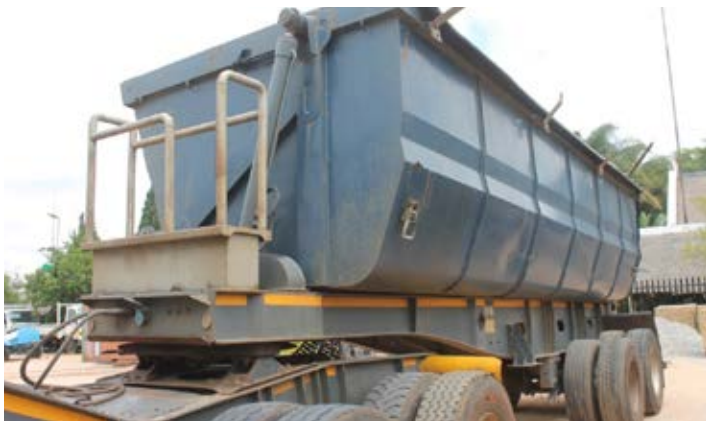
2013 Kearney Side Tipper Interlink