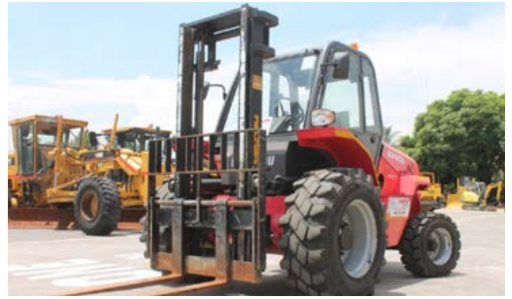
2x 2011 Manitou M30-2TH 4x2 Rough Terrain