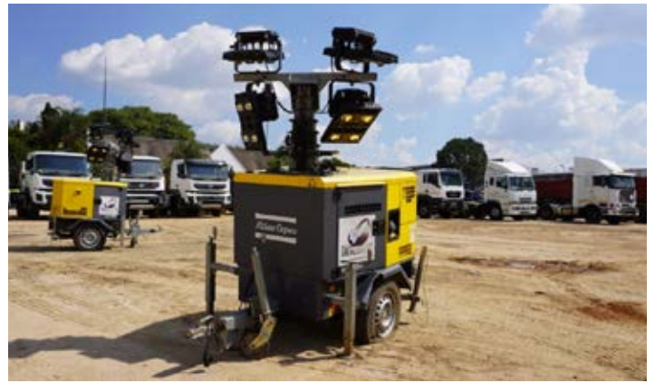
2x 2016 Atlas Copco Hi Light H5 Mobile Light Towers