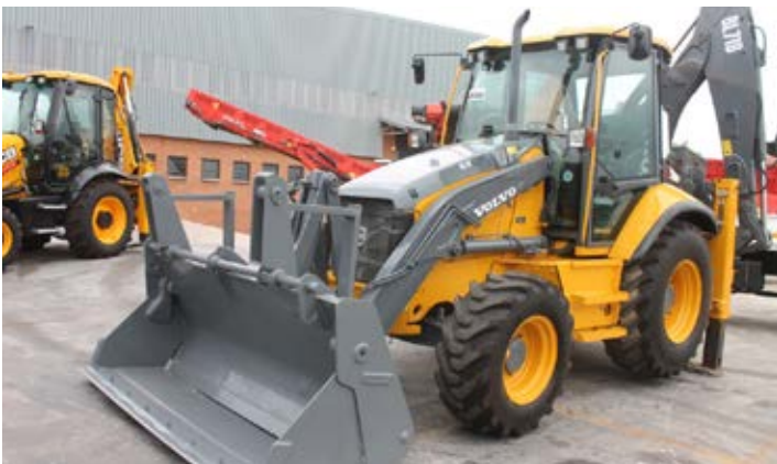
2015 Volvo BL71 4x4