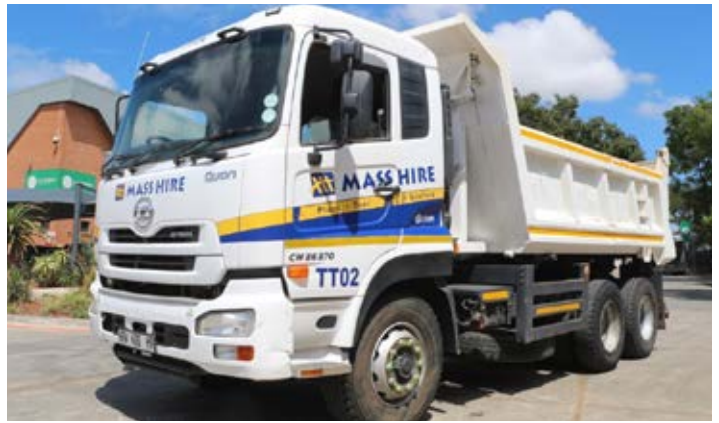
2015 UD CW26-370 6x4 10m 3 Tipper