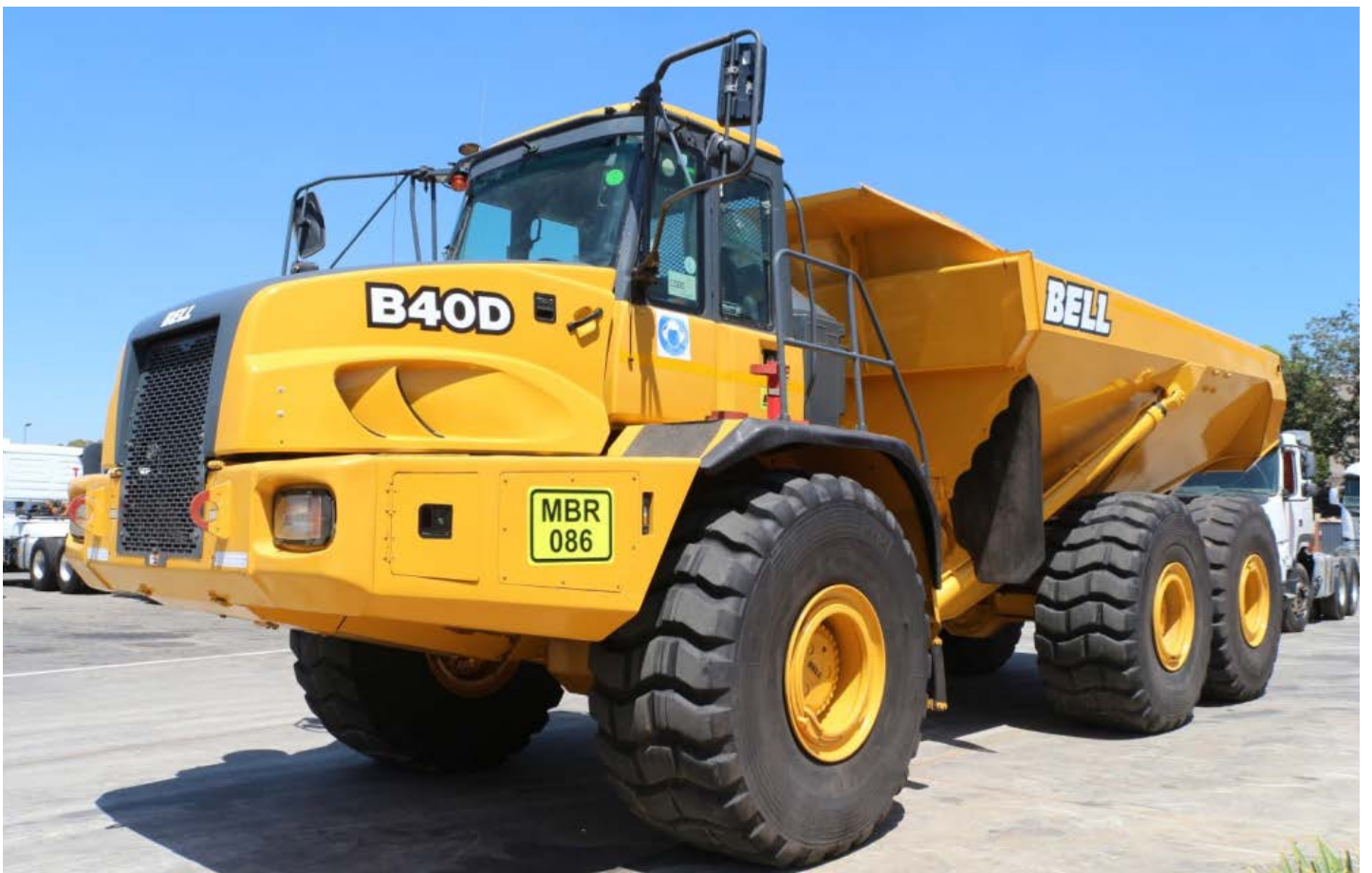
2012 Bell B40D 6x6 ADT