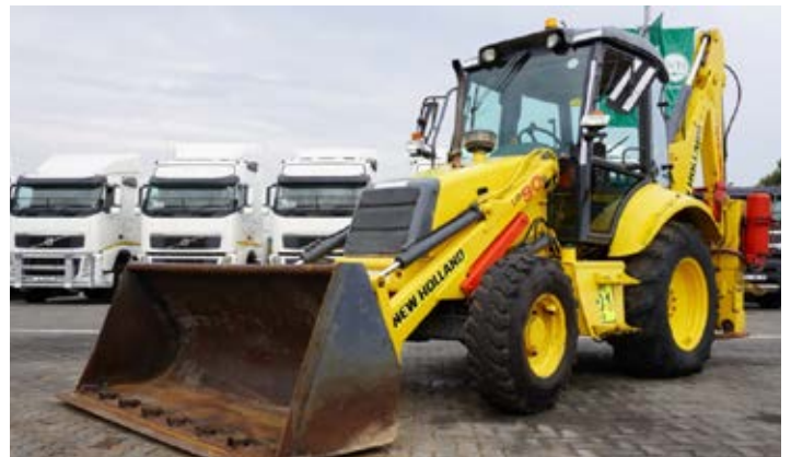
2x 2008 New Holland B90B 4x4