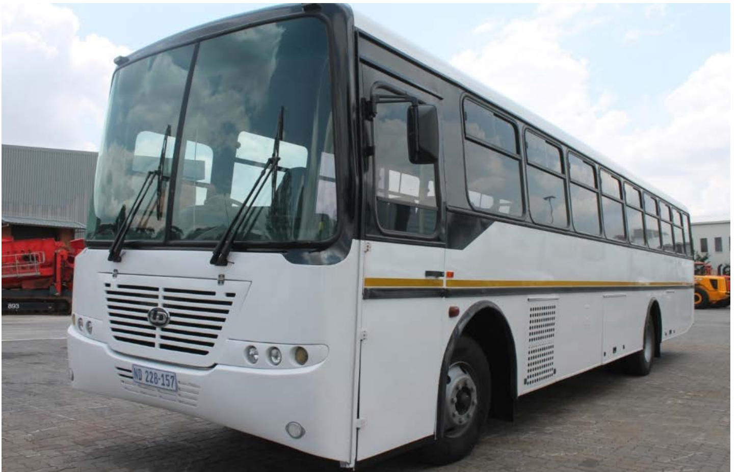
2010 Nissan UD95 65 Seater Bus