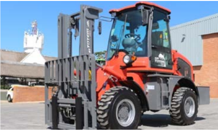
(Unused) Totem AF300 3 Ton 4x4 Rough Terrain