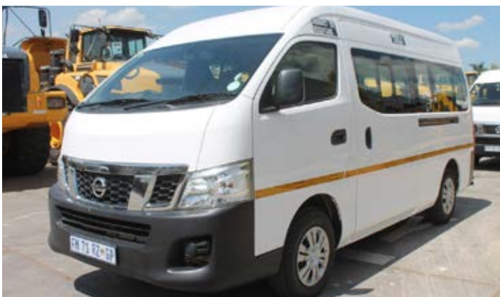
6x 2017 & 2016 Nissan NV350 2.5 Impendulo 16 Seaters