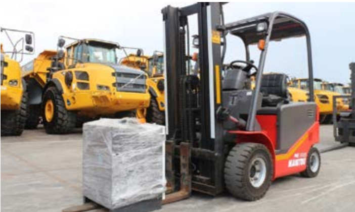
Manitou 2.5Ton ME425 Electric