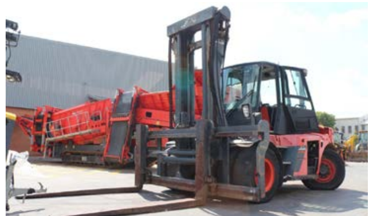
2013 Linde H140D 14 Ton