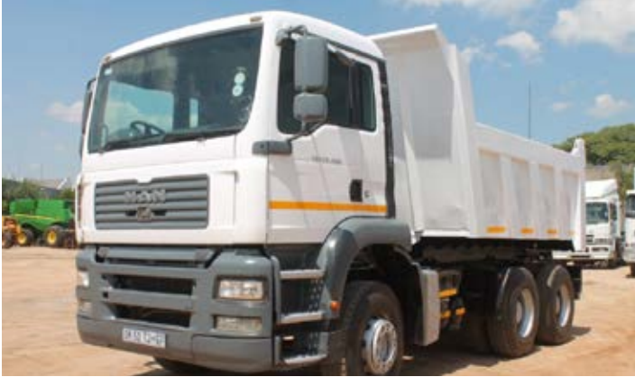
2007 MAN TGA33.360 6x4 10m 3 Tipper