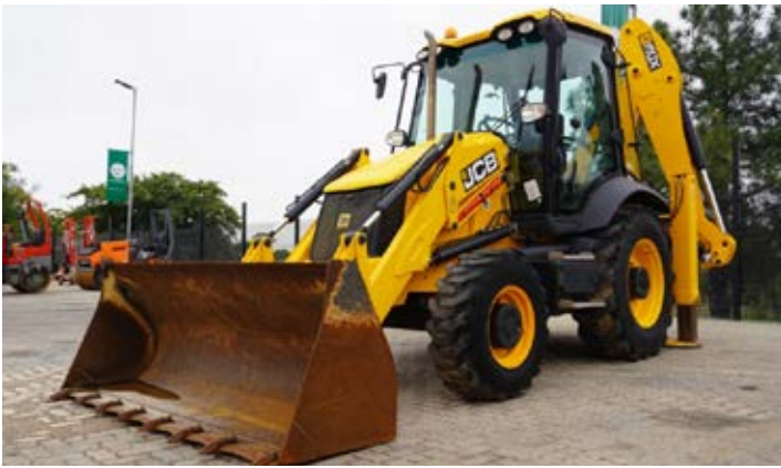
2x 2017 JCB 3CX 4x4