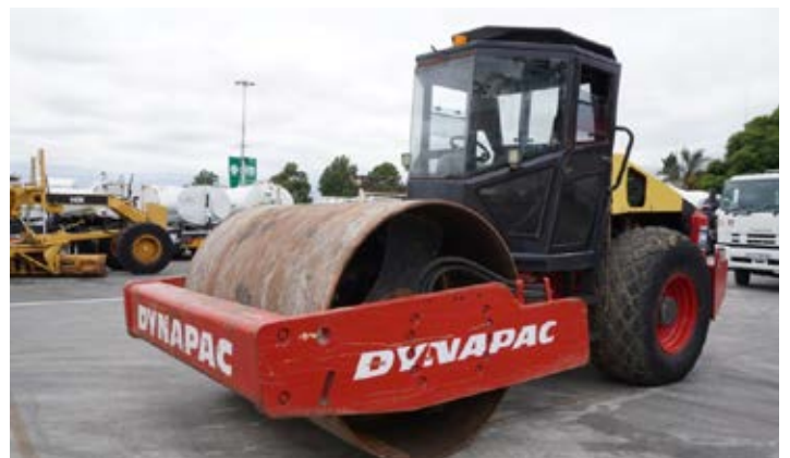
Dynapac CA270D 12 Ton Smooth Drum