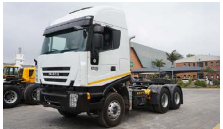
Unregistered / Unused Iveco 682 430 6x4