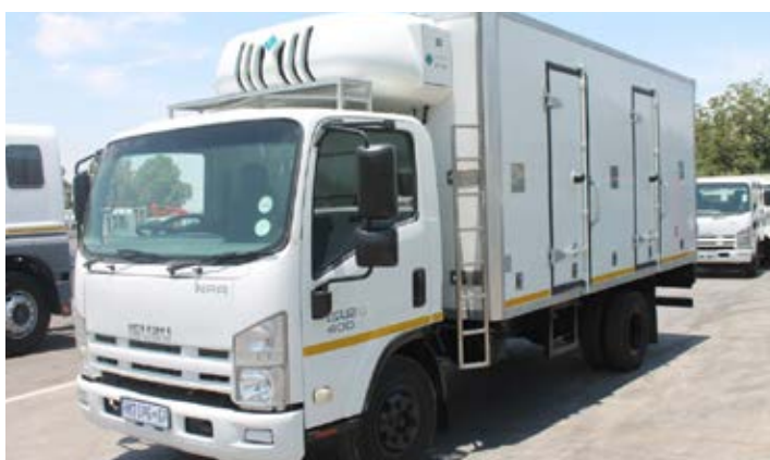
2010 Isuzu NPR400 Refrigerated