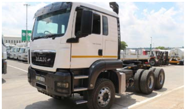
2014 MAN TGS33.440 6x4 Horse