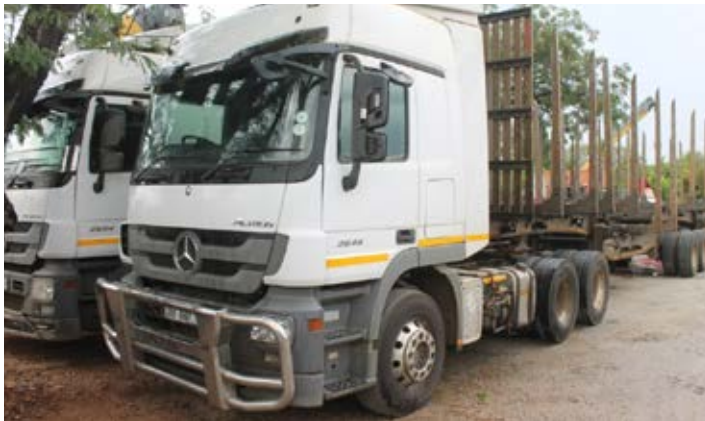
2017 Mercedes Benz Actros 2648 6x4