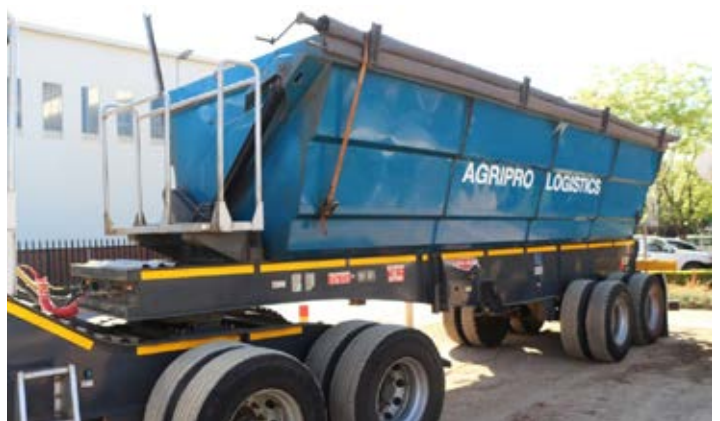
2017 Trailmax Interlink Side Tipper