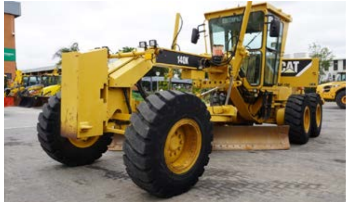
2014 Caterpillar 140K