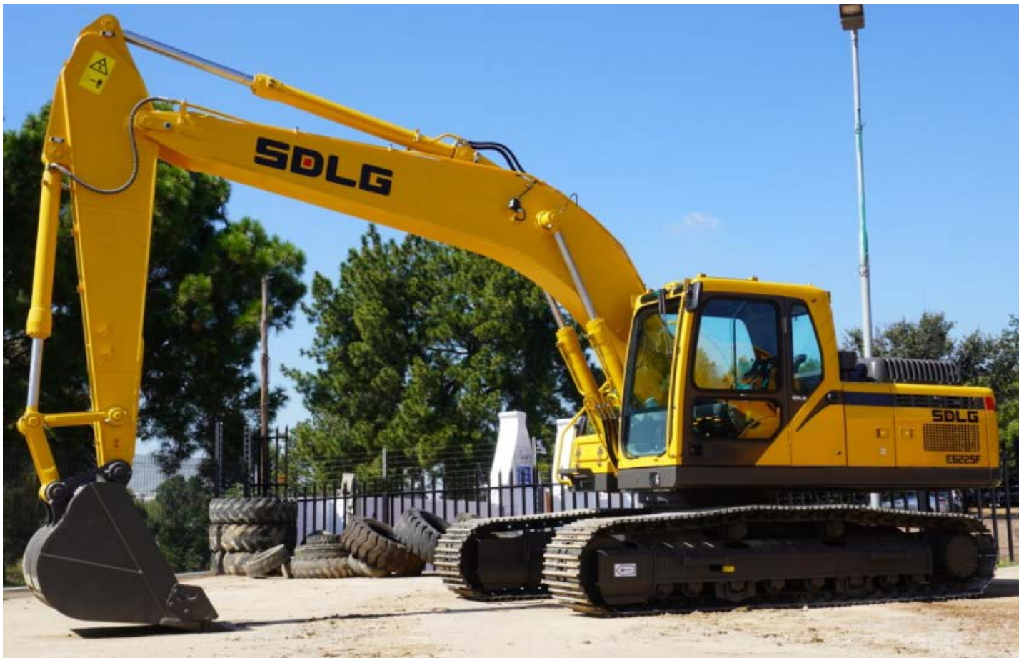
(Unused) 2020 SDLG E6225F | Yanmar SD60B 123kW Engine, Operating Weight: 21,700kg, Air Conditioned Cabin