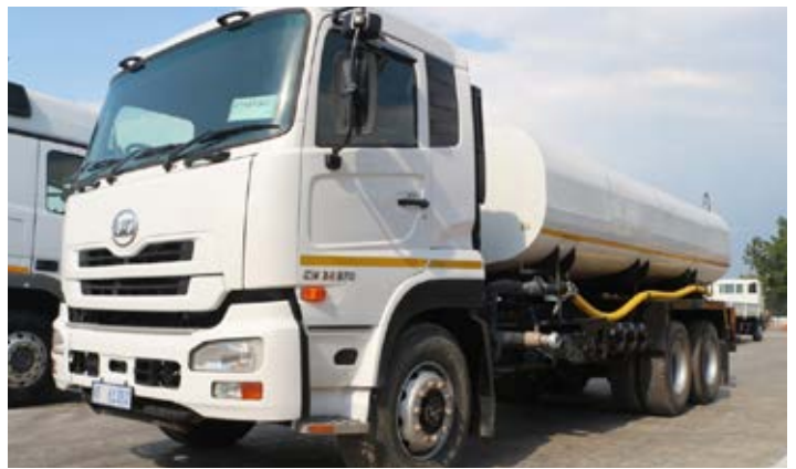
3x 2015 & 2014 UD CW26-370 6x4