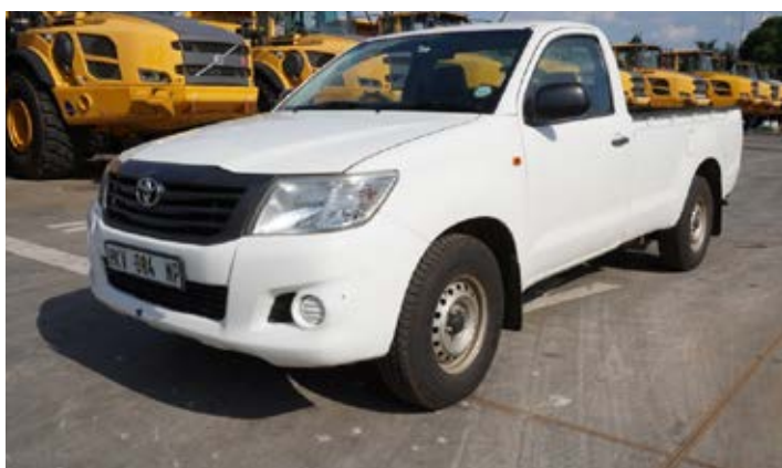
2014 Toyota Hilux 2.5D-4D Single Cab