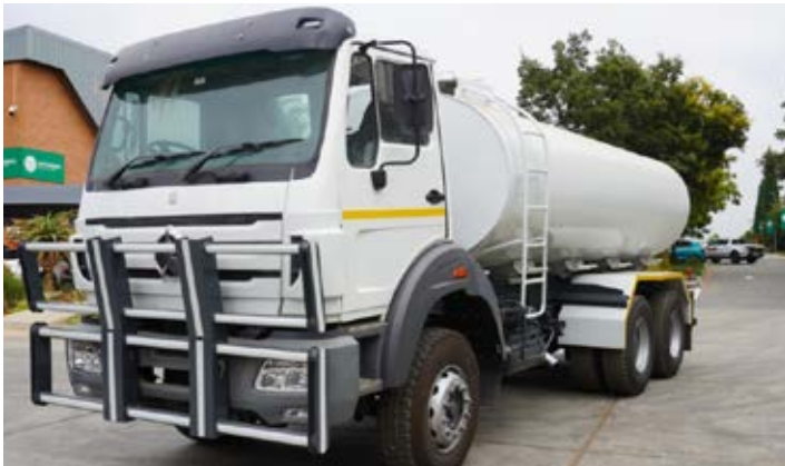
2014 Powerstar 2628VX 6x4