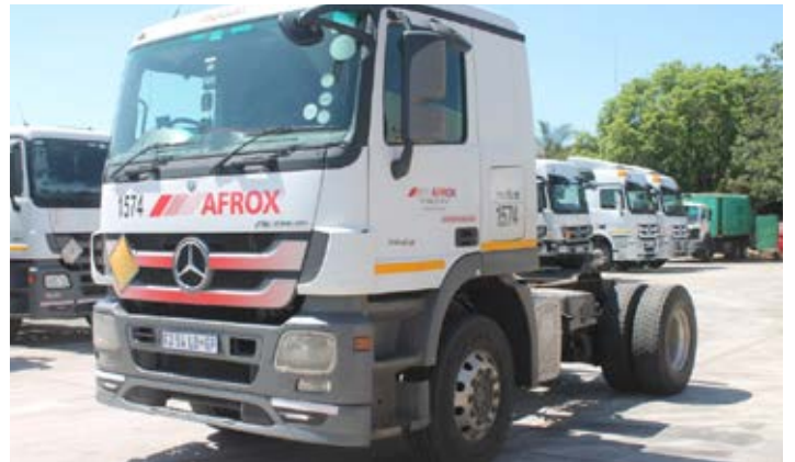
2016 Mercedes Benz Actros 1844LS/36 4x2