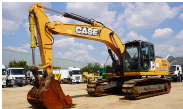
Case CX210B Excavator