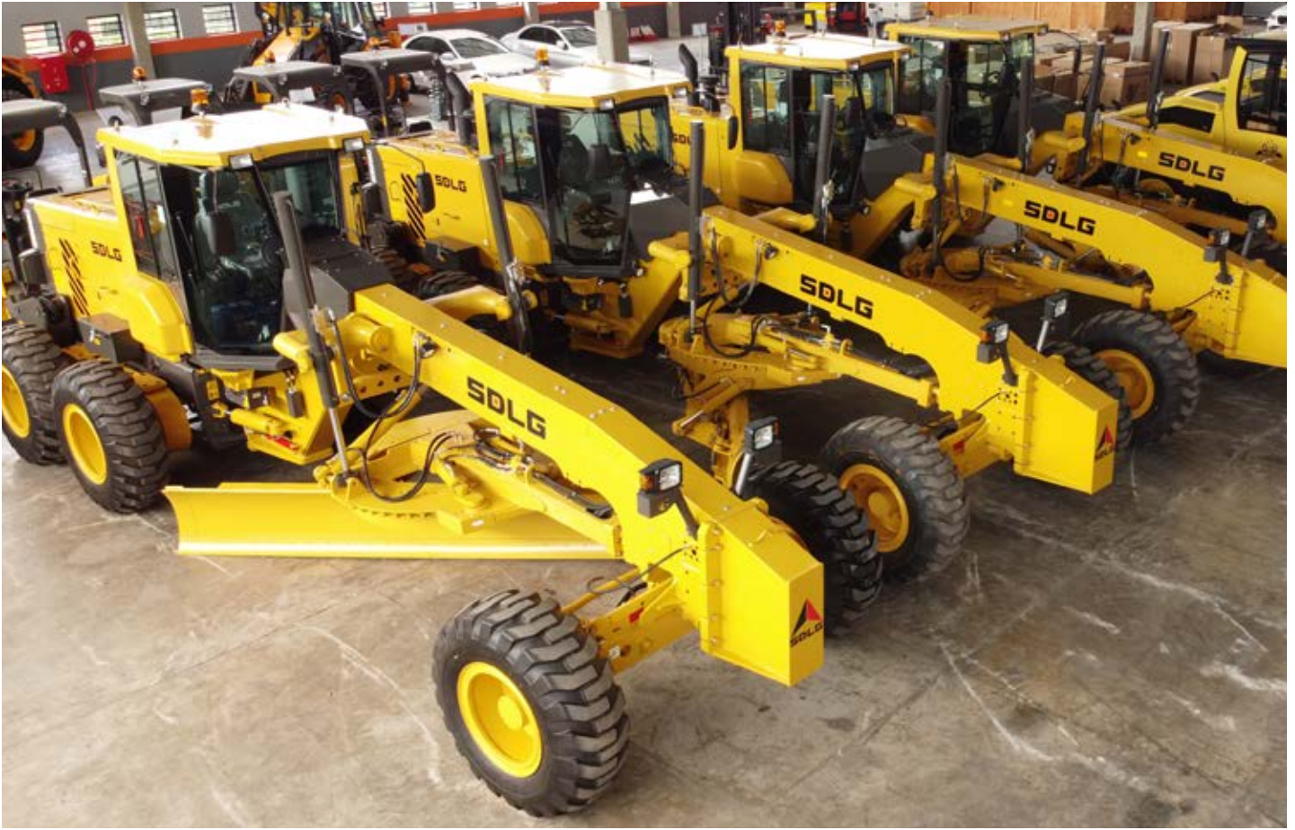
4x (Unused) 2020 SDLG G9220 Motor Graders | Deutz 165kW Engine, Air Conditioned Cabin