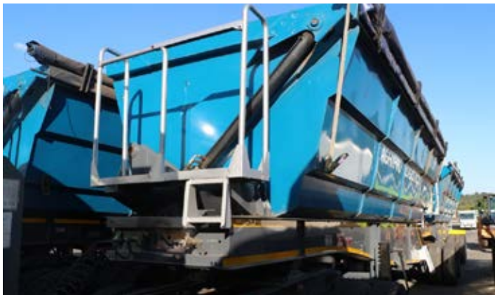
2017 Trailmax Side Tipper Interlink