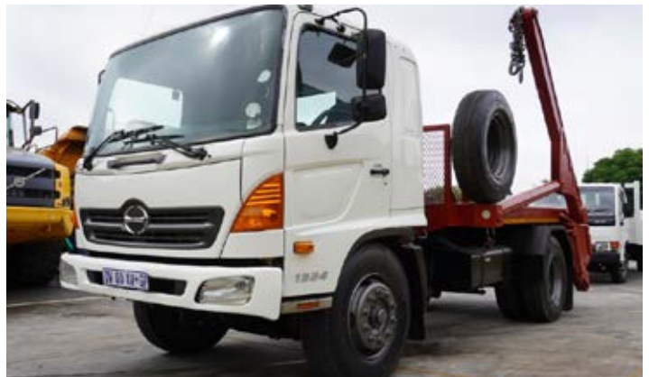
2015 Hino 500 1324 Skip Bin Loader