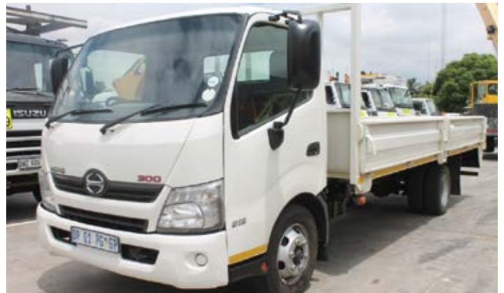
2015 Hino 300 915 4x2 Dropside A/T