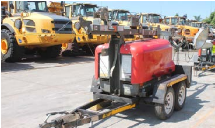
2x 2010 Wacker Neuson/AWE Mobile Light Towers