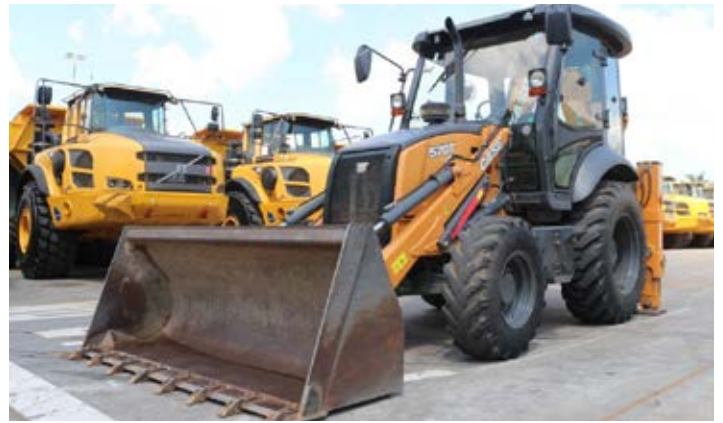
2017 Case 570T 4x4