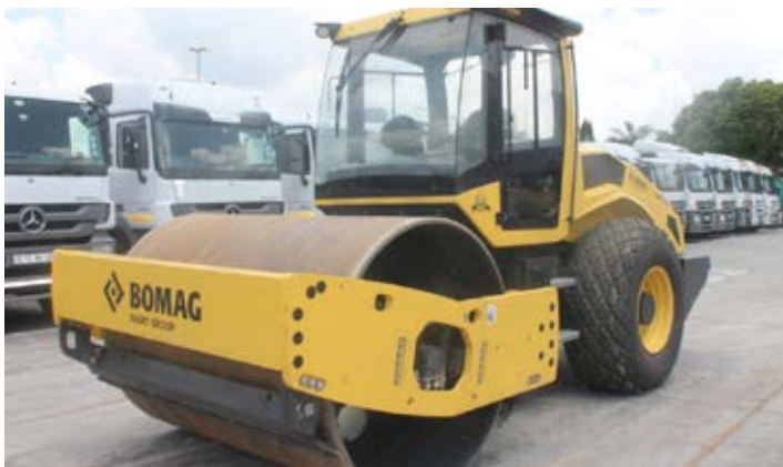
2018 Bomag BW213D-5 13 Ton Smooth Drum