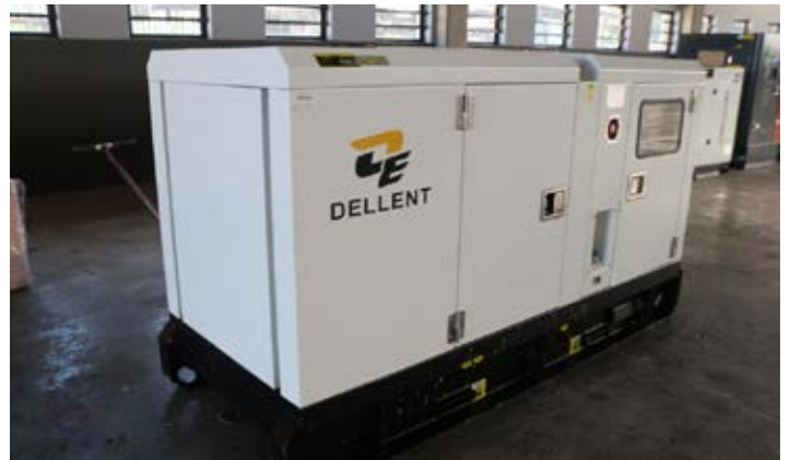
2019 Dellent 50Kva Silent Diesel Generator - Used