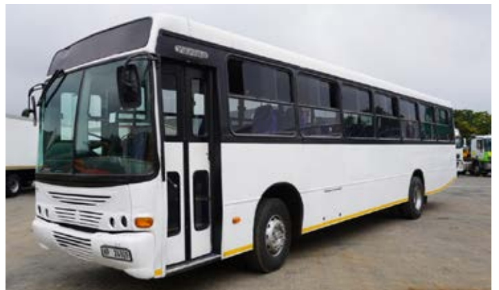
2x 2003 Mercedes Benz 65 Seaters