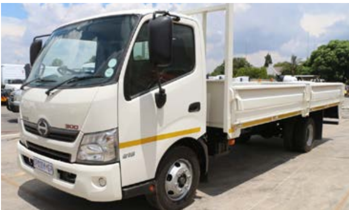
2x 2015 & 2012 Hino 300 815 4x2 Dropside A/T