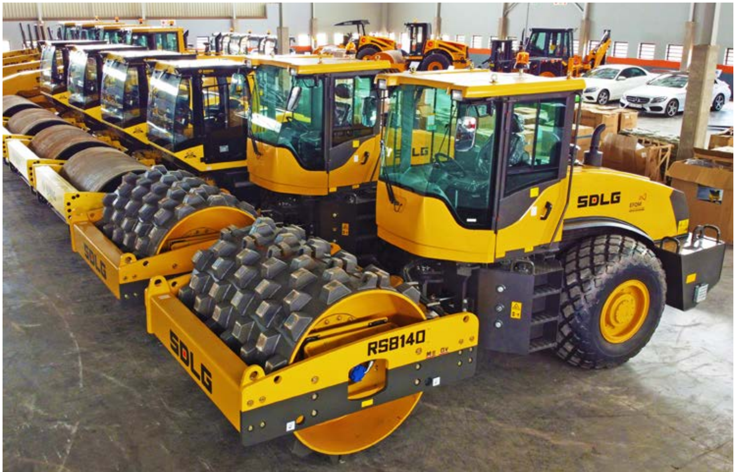
2x (Unused) 2020 SDLG RSB140 14 Ton Smooth Drum | Padfoot Clamshell, Weichai 92kW Engine, A/C, Weight: 14,000kg