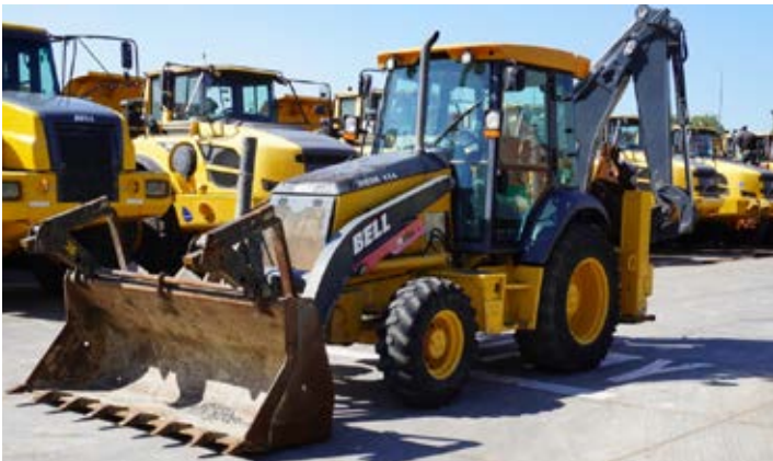
2015 Bell 315SK 4x4