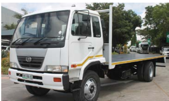
2005 Nissan UD80 4x2 Flatdeck