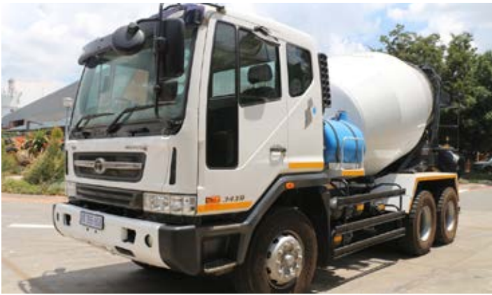
2014 Tata Novus 3439 6x4 6m 3 Cement Mixer