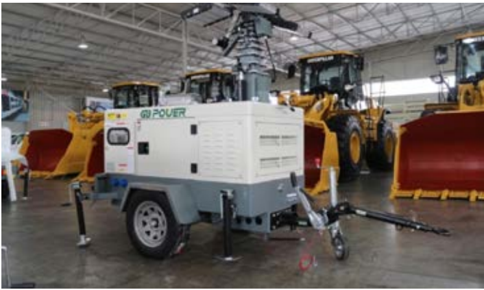
WAHA GBT-G4000 Mobile Light Tower & Generator