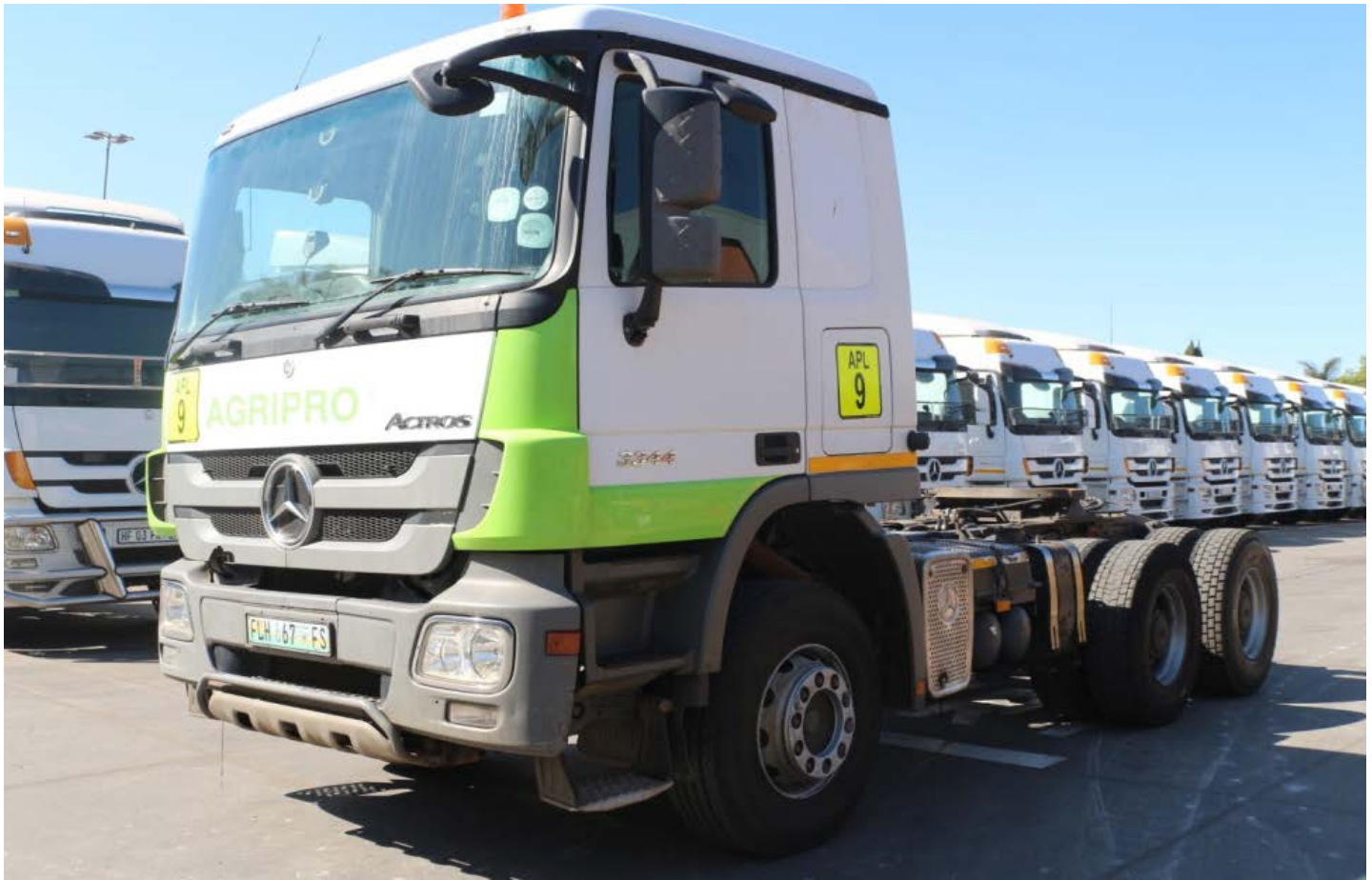
4x 2014 Mercedes Benz Actros 3344 6x4