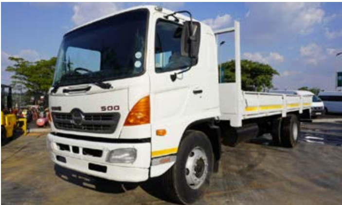
2010 Hino 500 1626 Dropside