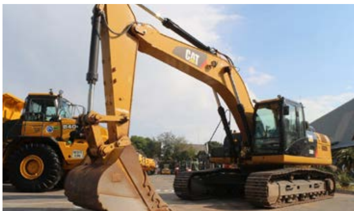
2017 Caterpillar 330D2L