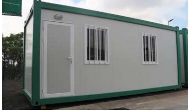
4x Nova 6m Site Offices & Nova 6m Ablutions