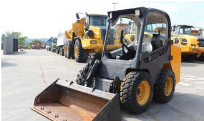
2013 JCB 155 Eco Skidsteer