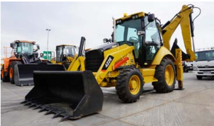
2007 Caterpillar 422E 4x4