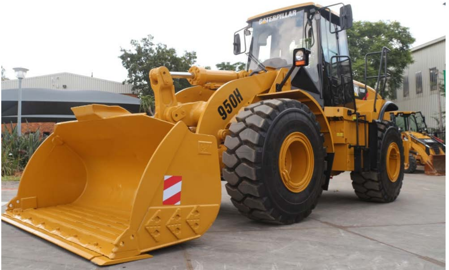
2008 Caterpillar 950H