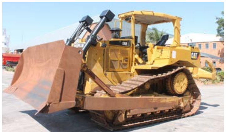
2016 Caterpillar D6RXL Dozer