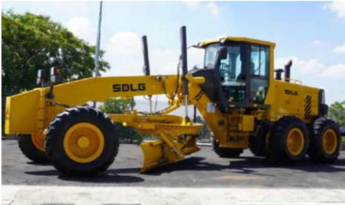
2020 SDLG G9220 (Unused) - Choice of 4