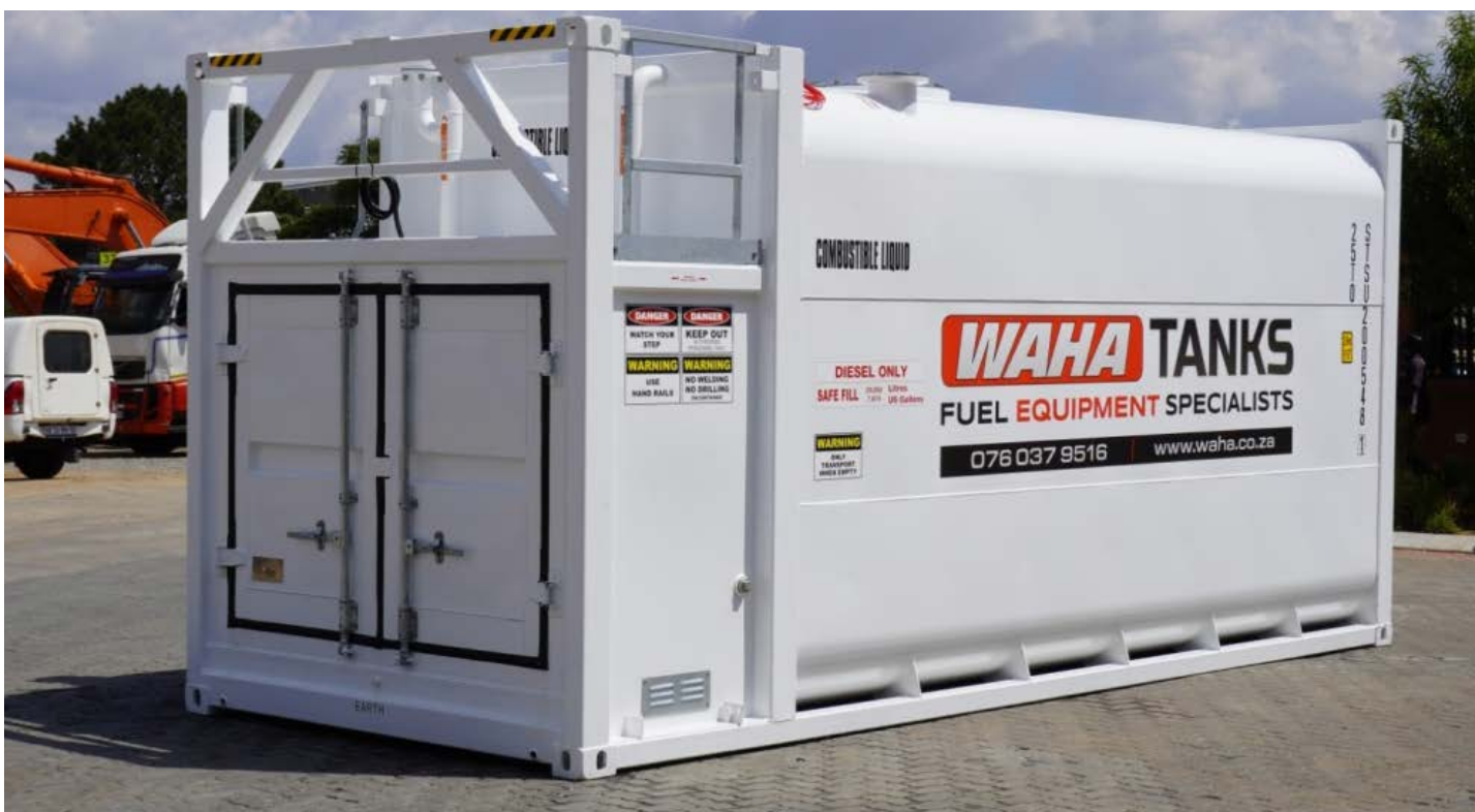
2x Unused / 2020 30,000L Self Bunded Containerised Fuel Tanks