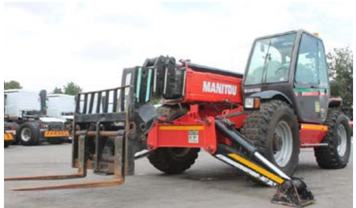
2005 Manitou MT1740SL 4x4 Telehandler