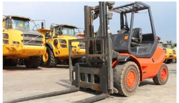
2014 Linde H50D-5 5Ton Diesel