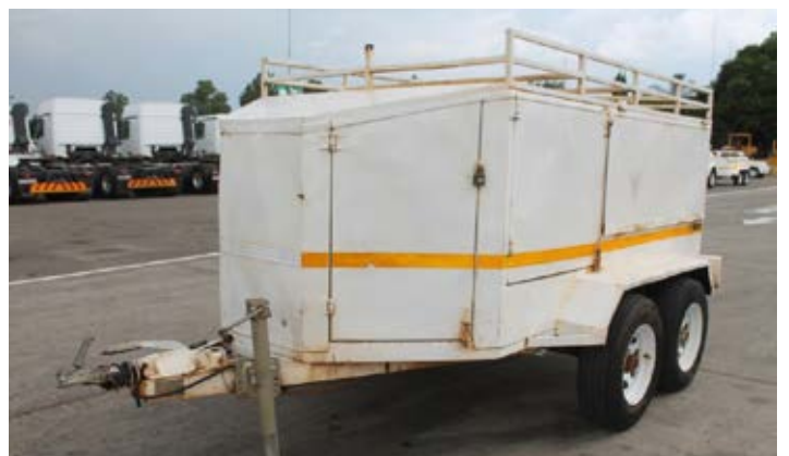
2011 V-Tec Double Axle Box Body Trailer