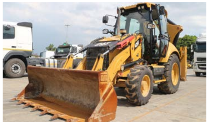
2013 Caterpillar 428F 4x4