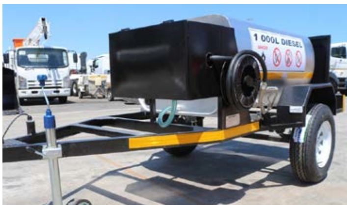
2020 Platinum 1,000L Diesel Bowser Trailer