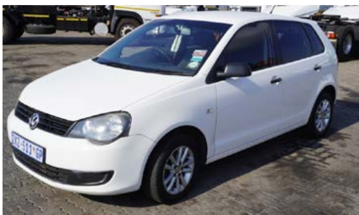
2010 Volkswagen Polo Vivo 1,6 Sedan