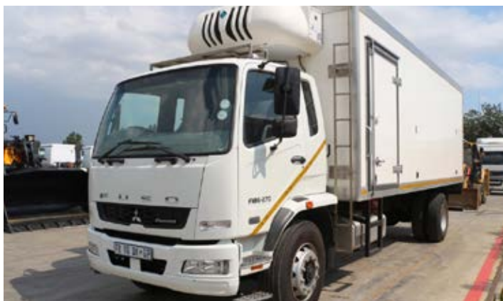
2x 2017 Fuso FM16-270 4x2 Refrigerated