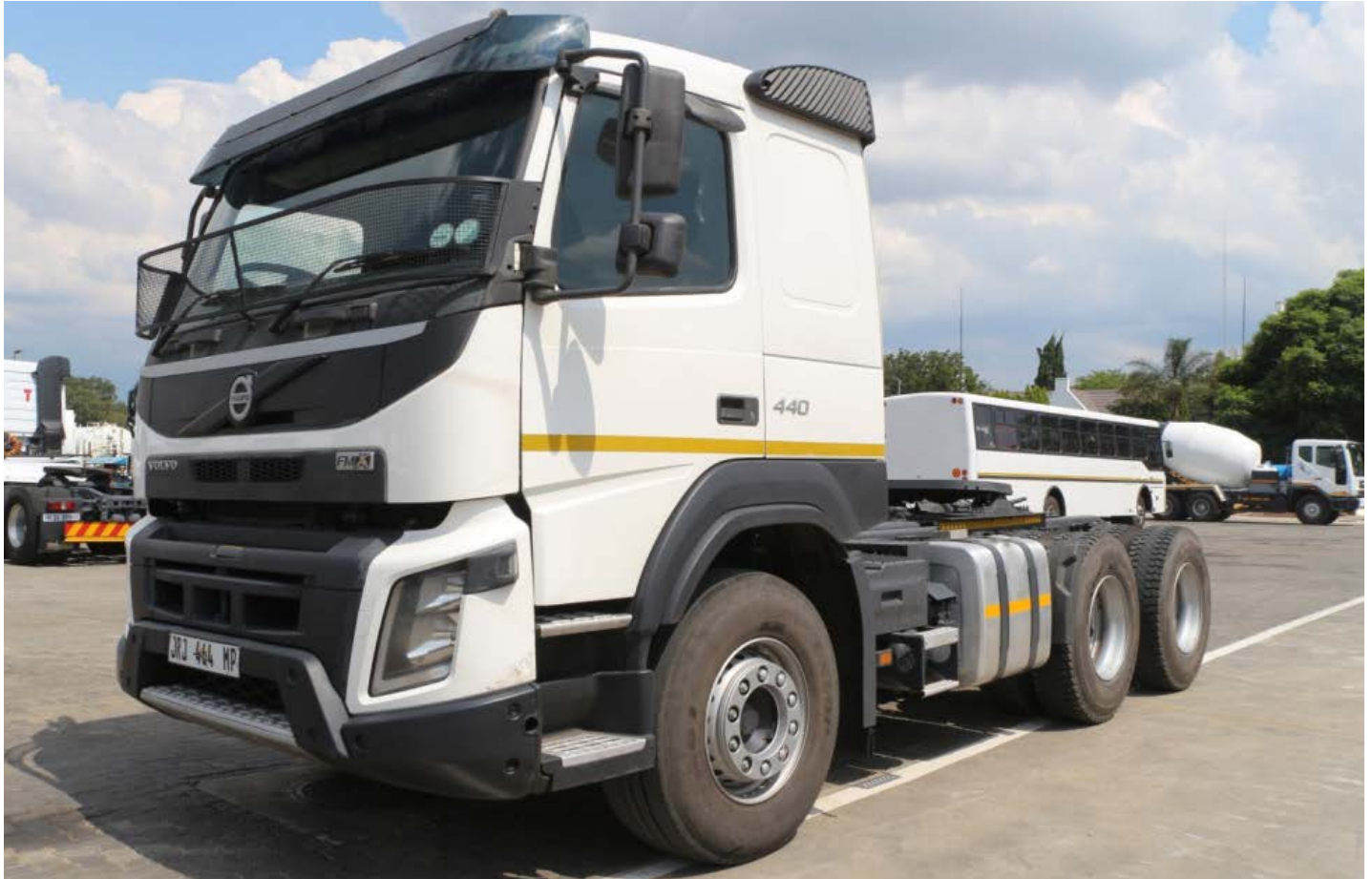
5X 2015 - 2012 Volvo FMX440 6x4's