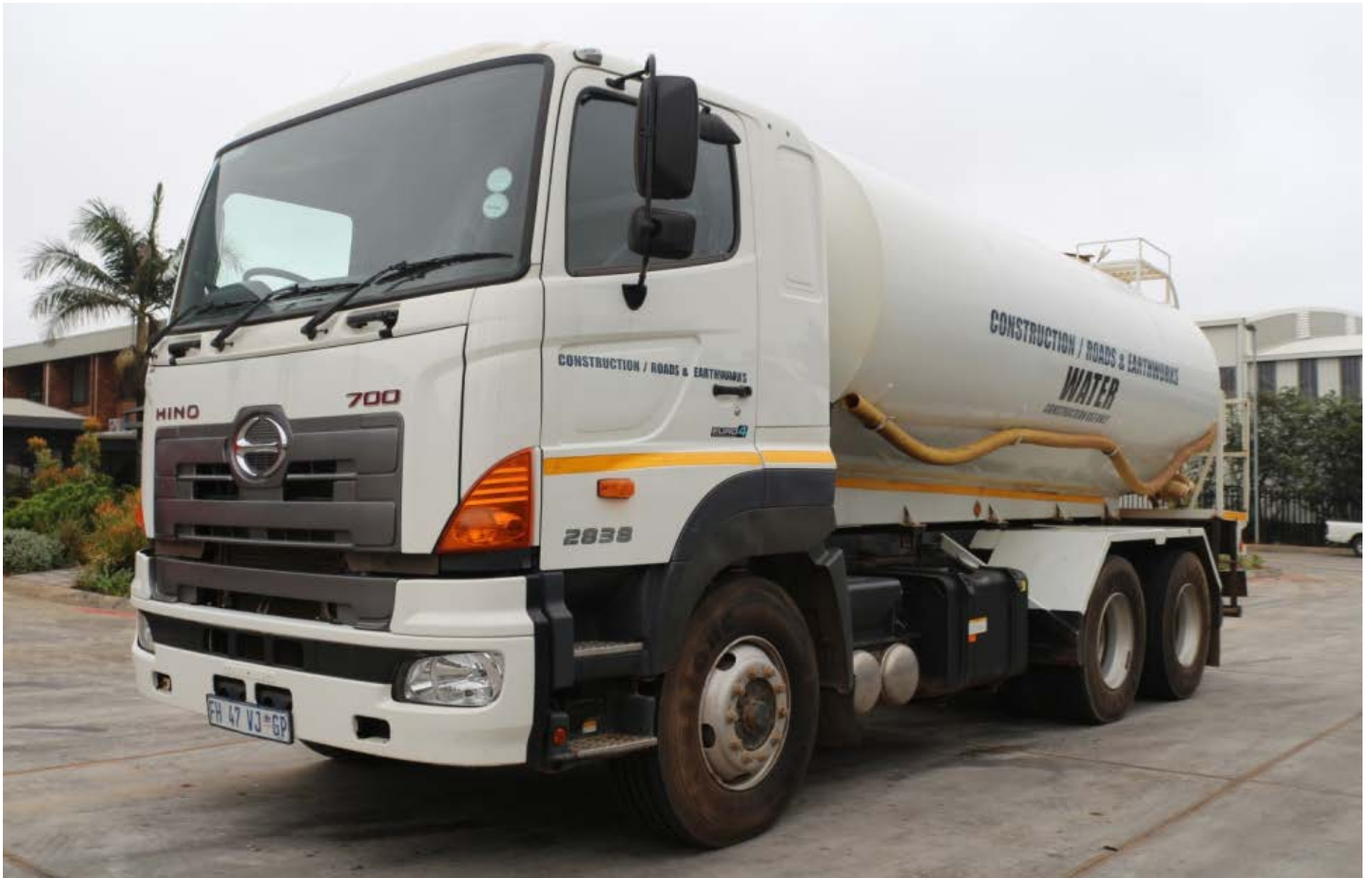
2016 Hino 700 2838 16,000L