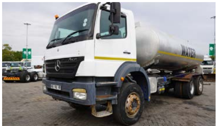
2010 Mercedes Benz Axor 6x4