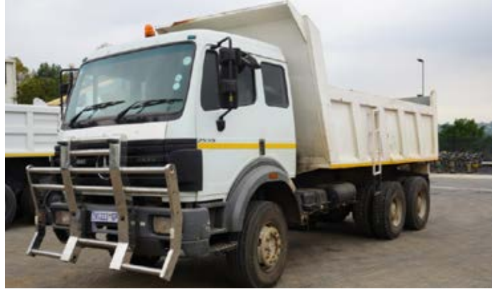
1998 Mercedes Benz 2535 6x4 10m 3 Tipper