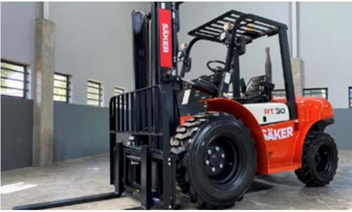
(Unused) Saker 3 Ton 4x2 Rough Terrain