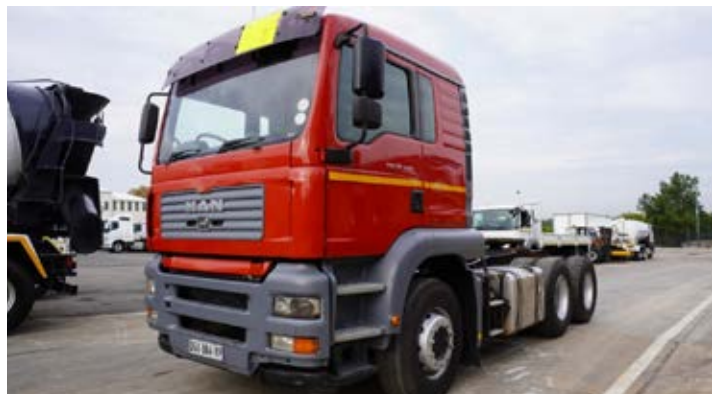
2006 MAN TGA26-410 6x4