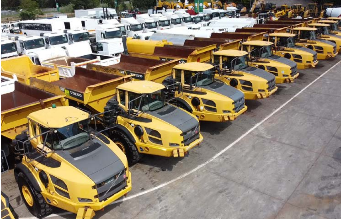
10x 2012 & 2011 Volvo A40F 6x6 ADT's