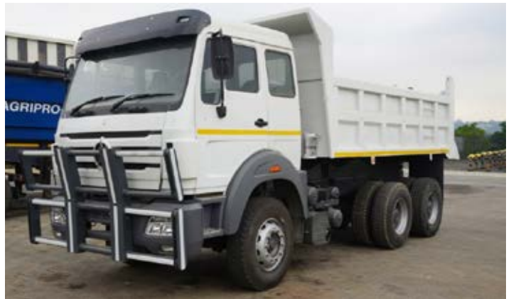
2x 2013 Powerstar 2628VX 6x4 10m 3 Tipper2