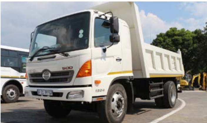
2015 Hino 500 1324 4x2 6m 3 Tipper