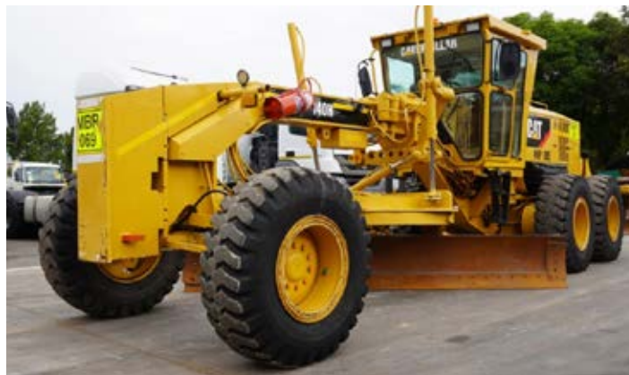
2005 Caterpillar 140H