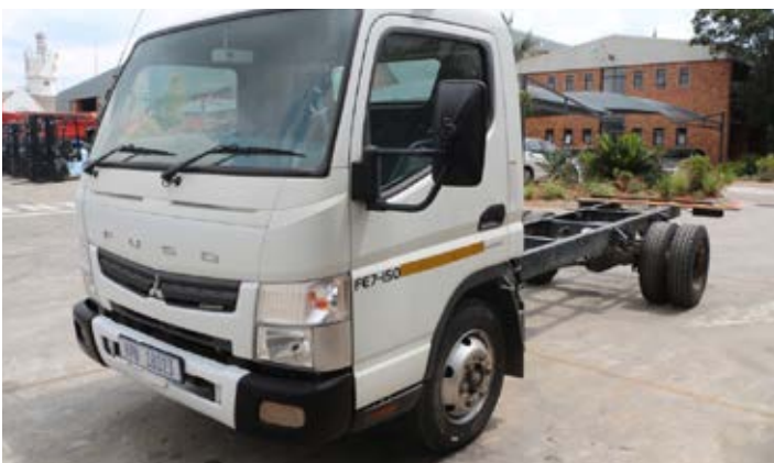
2015 Mitsubishi Fuso FE7-150 Chassis Cab