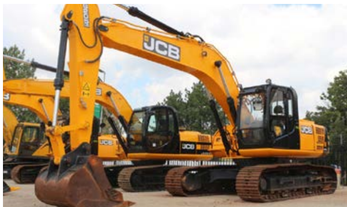
2 x 2017 JCB JS205LC