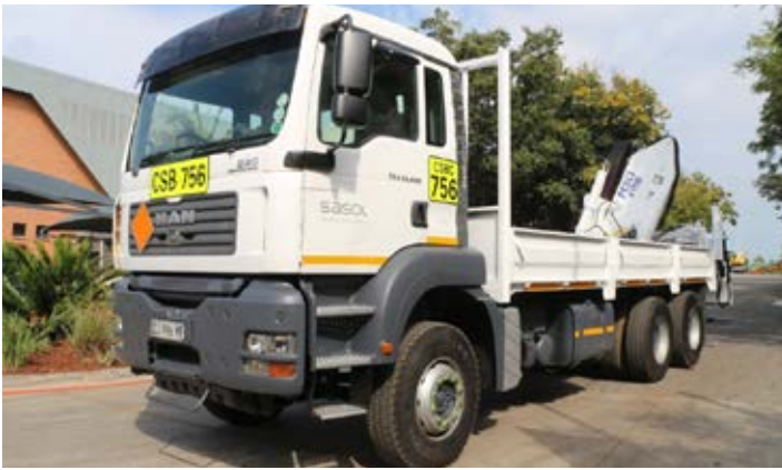
2009 MAN TGA33.400BB 6x4 Dropside Crane