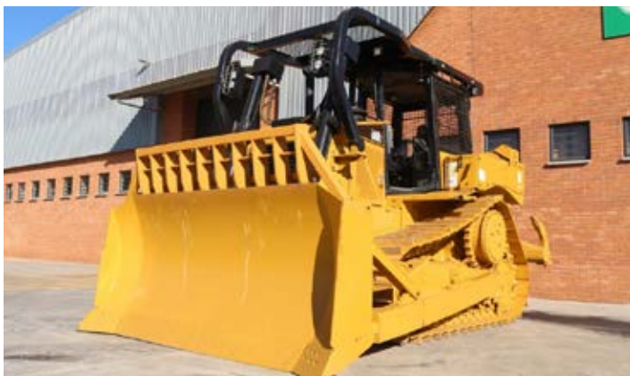
(Unused) 2016 Caterpillar D6R2 Dozer