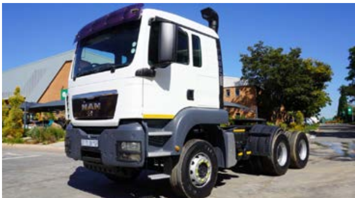
2011 MAN 33-440BBS 6x4