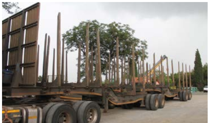
2X 2017 & 2016 PRBB Interlink Log Carriers