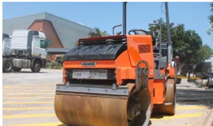
2005 Hamm HD12 Double Drum