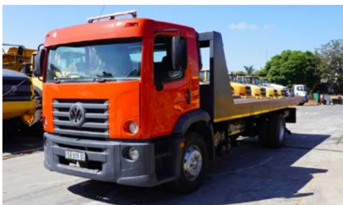
2008 Volkswagen 13-180 4x2 Rollback