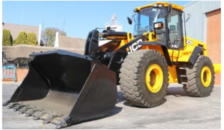
2010 JCB 456Z