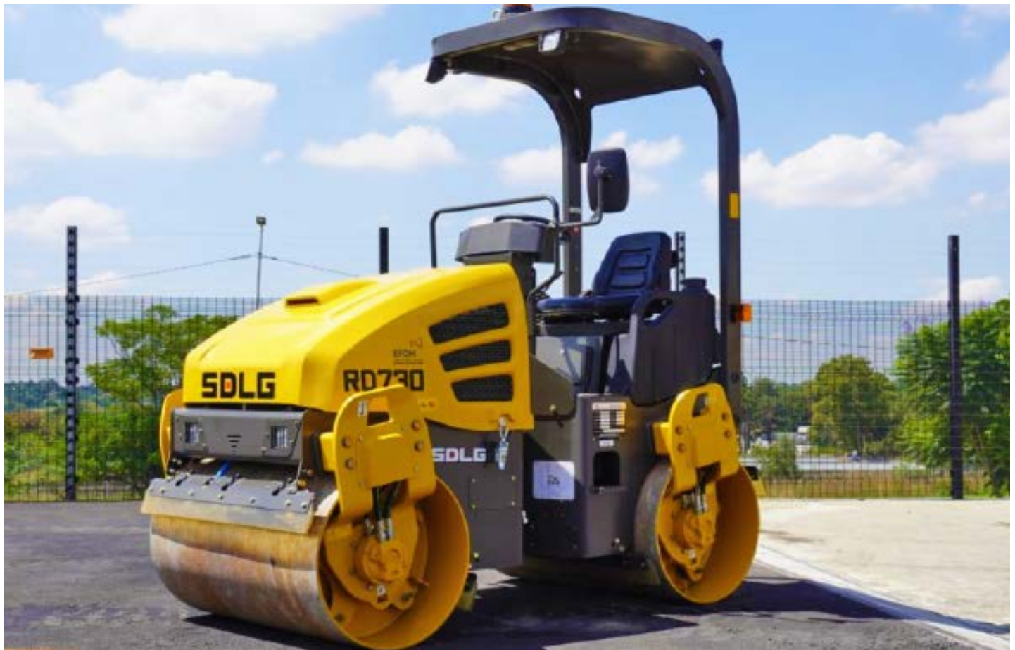
4x (Unused) 2020 SDLG RD730 3 Ton Double Drum | Kubota 24.4kW Engine, Canopy, Weight: 3,000kg