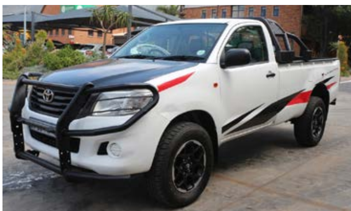
2015 Toyota Hilux 2.5 D-4D SRX Single Cab