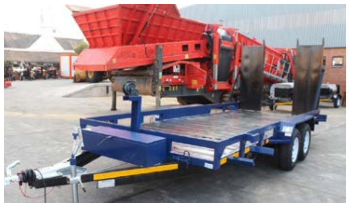
2020 Platinum 2.5Ton Double Axle Car Trailer