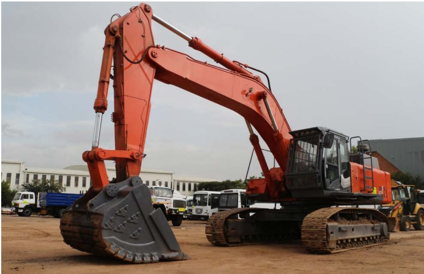
2010 Hitachi 470LCR-3 Excavator