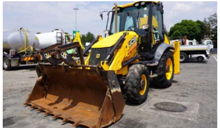
2x 2015 JCB 3CX 4x4