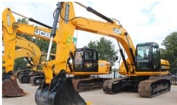
2011 JCB JS200-SC