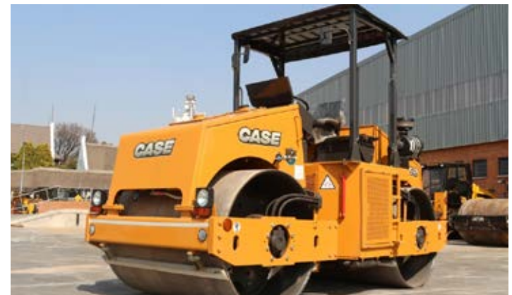
2018 Case 752 10 Ton Double Drum