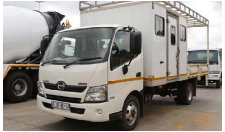
2017 Hino 300 714 4x2 Dropside