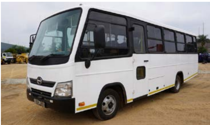
2014 Hino 35 Seater Bus