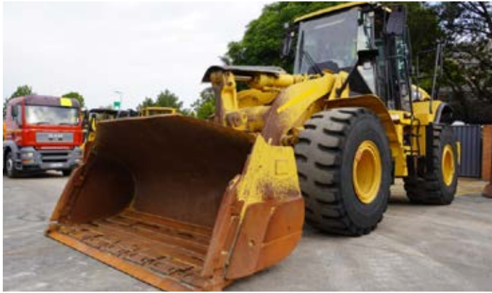
2011 Caterpillar 950H