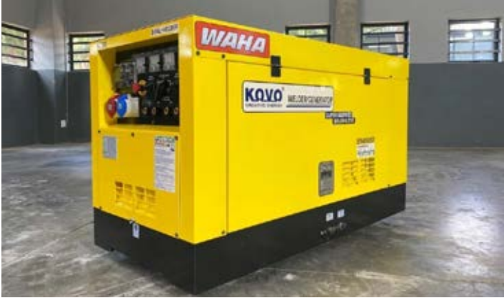
WAHA Enclosed 400A Welder/15kVA Generator