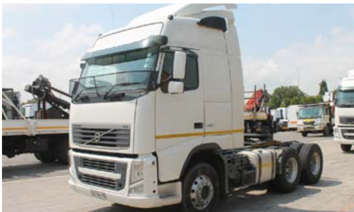
2x 2014 Volvo FH480 6x4