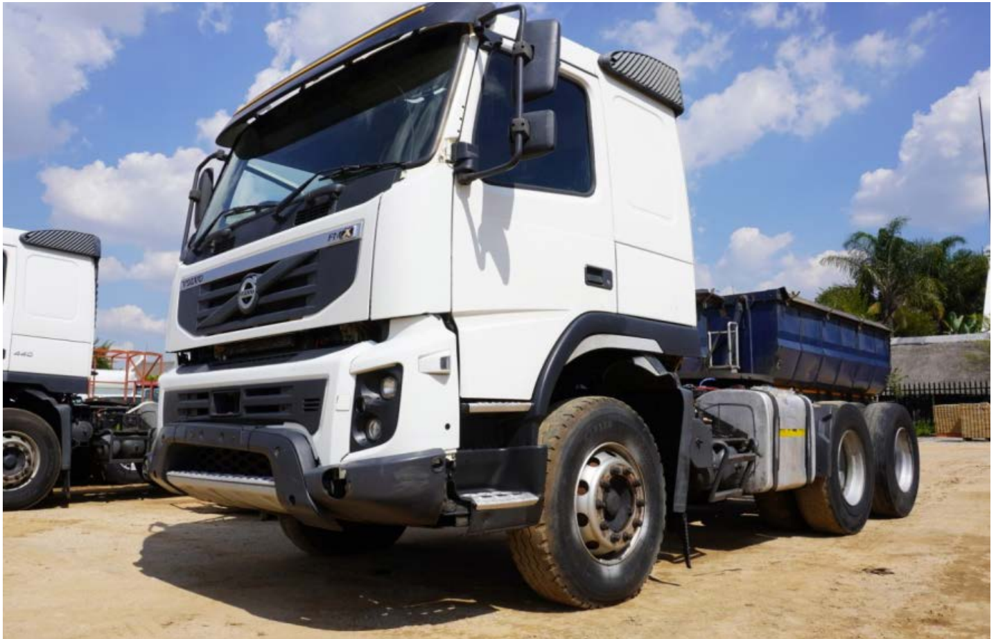
7x 2012 & 2011 Volvo FMX440 6x4's