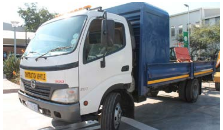
2011 Hino 300 814 4x2 Dropside