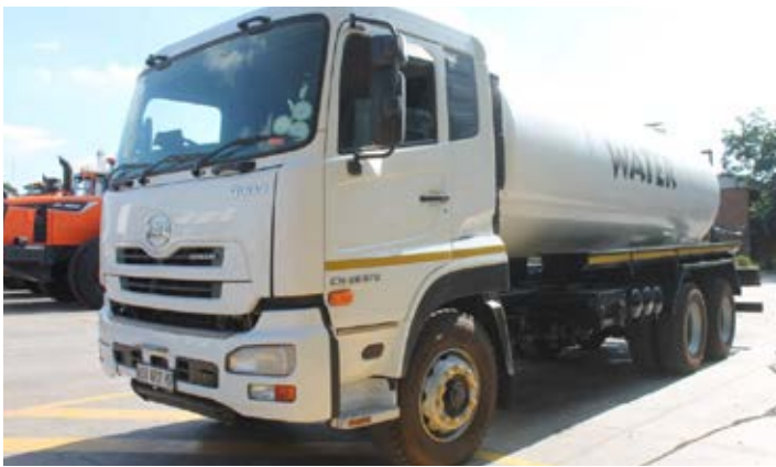
2x 2015 & 2014 UD CW26-370 6x4